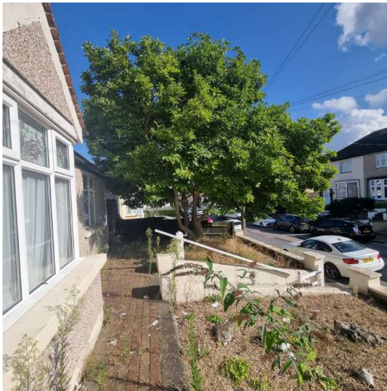
Images looking at the front garden of 108 Havelock Road.