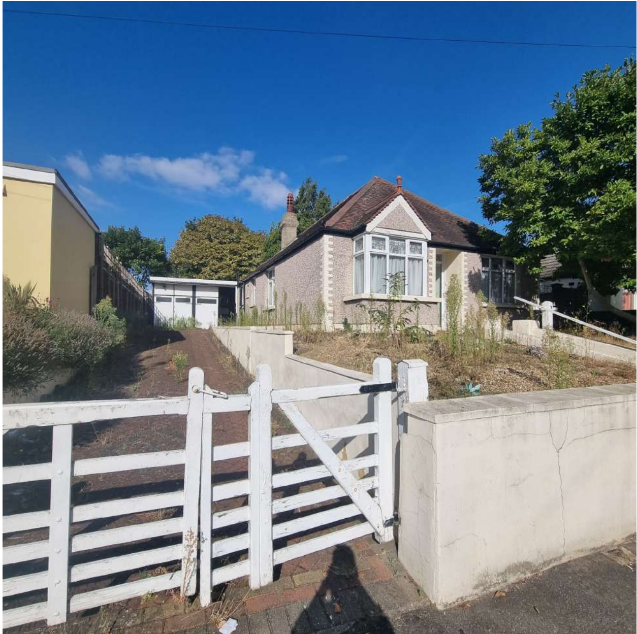
Image looking at the front of 108 Havelock Road.