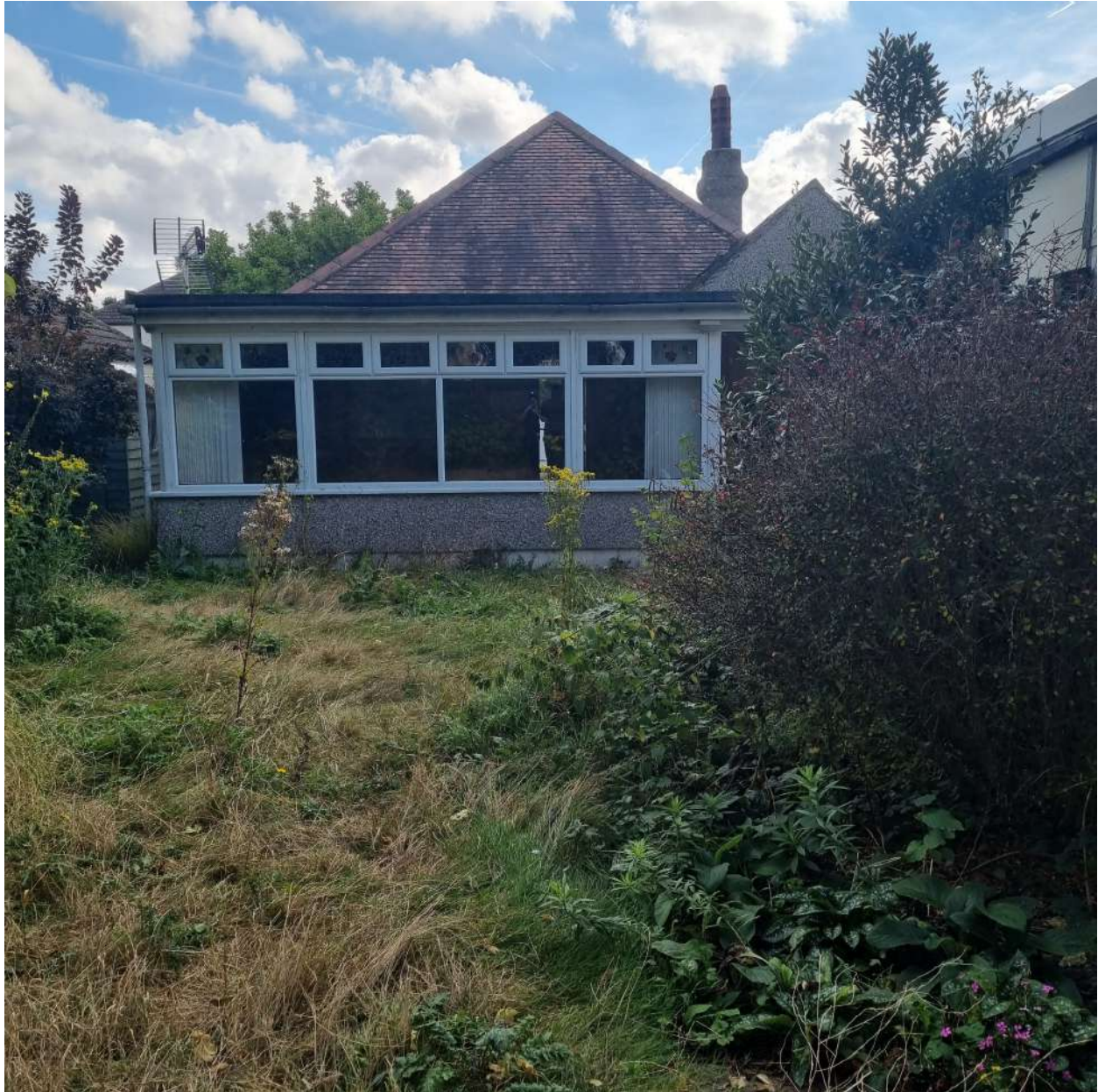
Image looking at the rear of 108 Havelock Road.