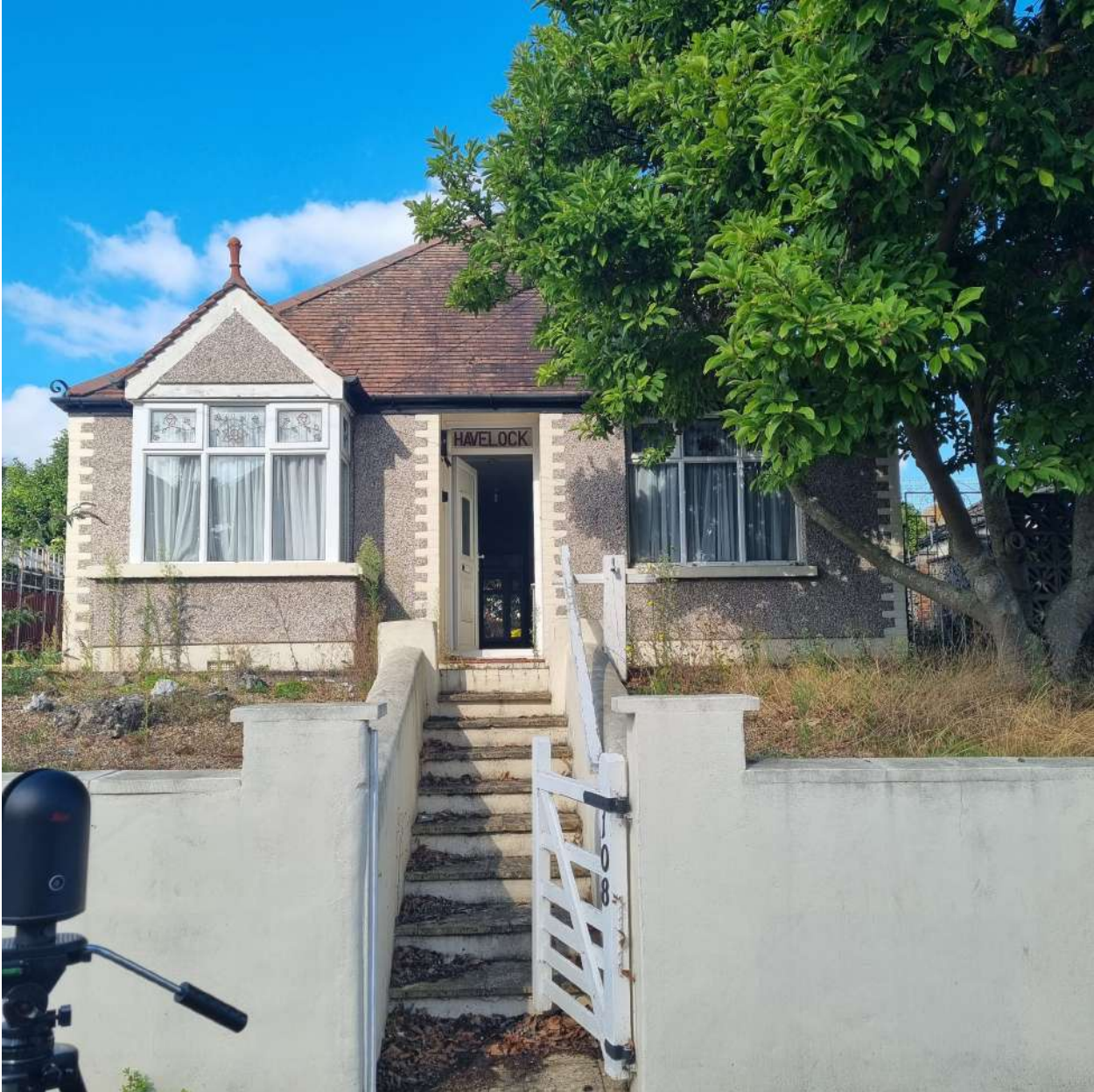
Image looking at the front of 108 Havelock Road.