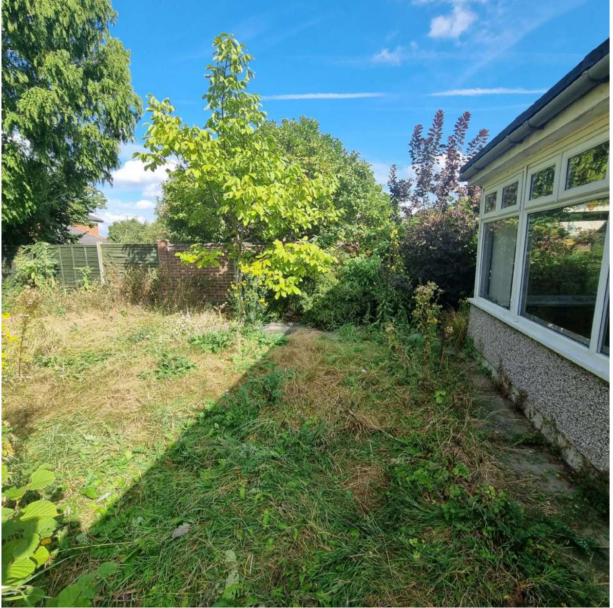
Image looking at the rear/side of 108 Havelock Road.