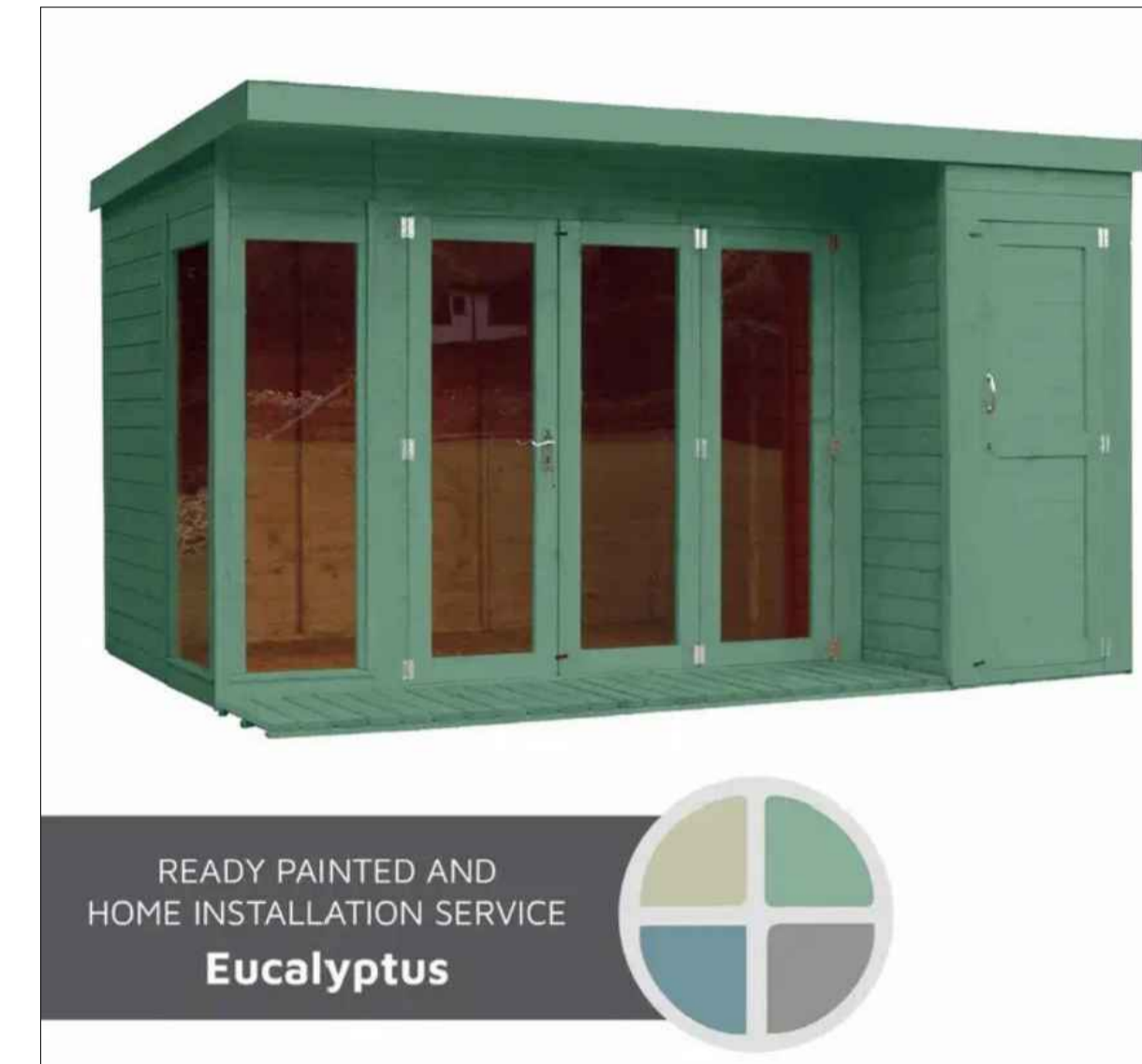
Product Visual. nts