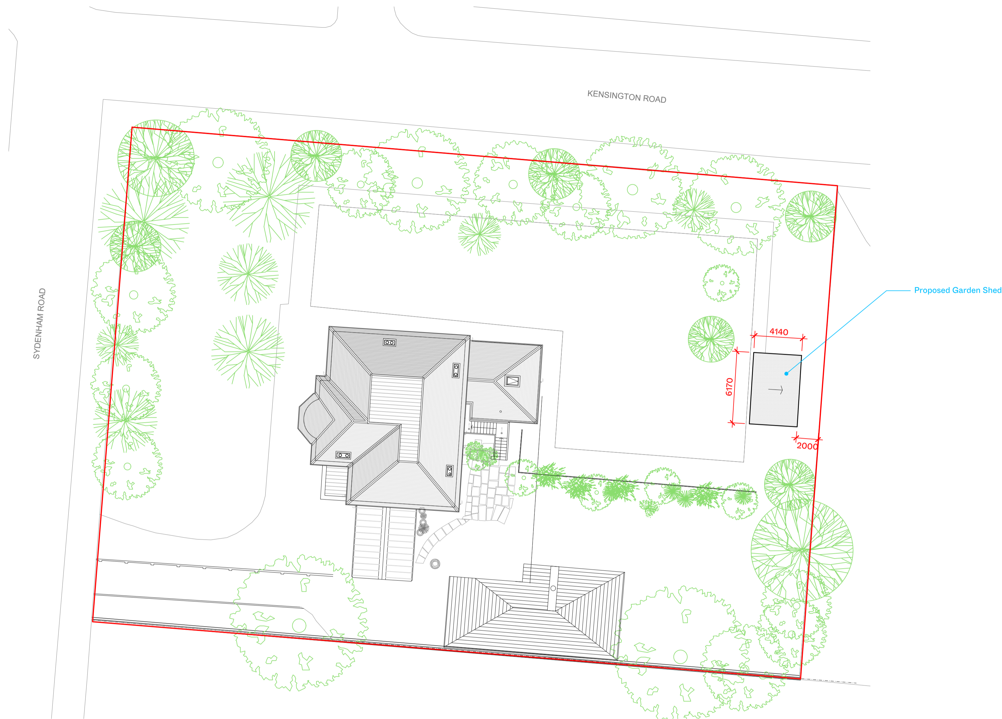
Block Plan. Scale 1:200