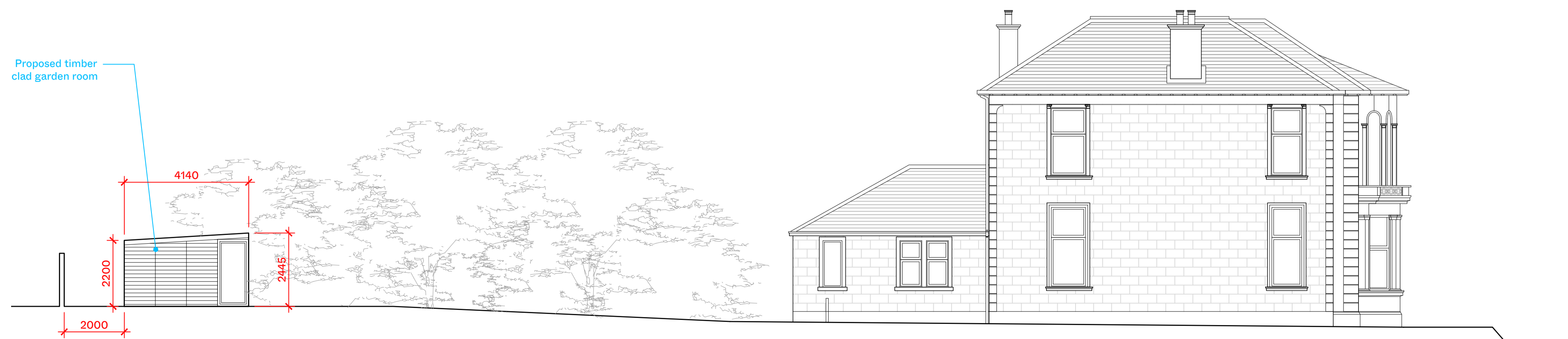
North Elevation. Scale 1:100