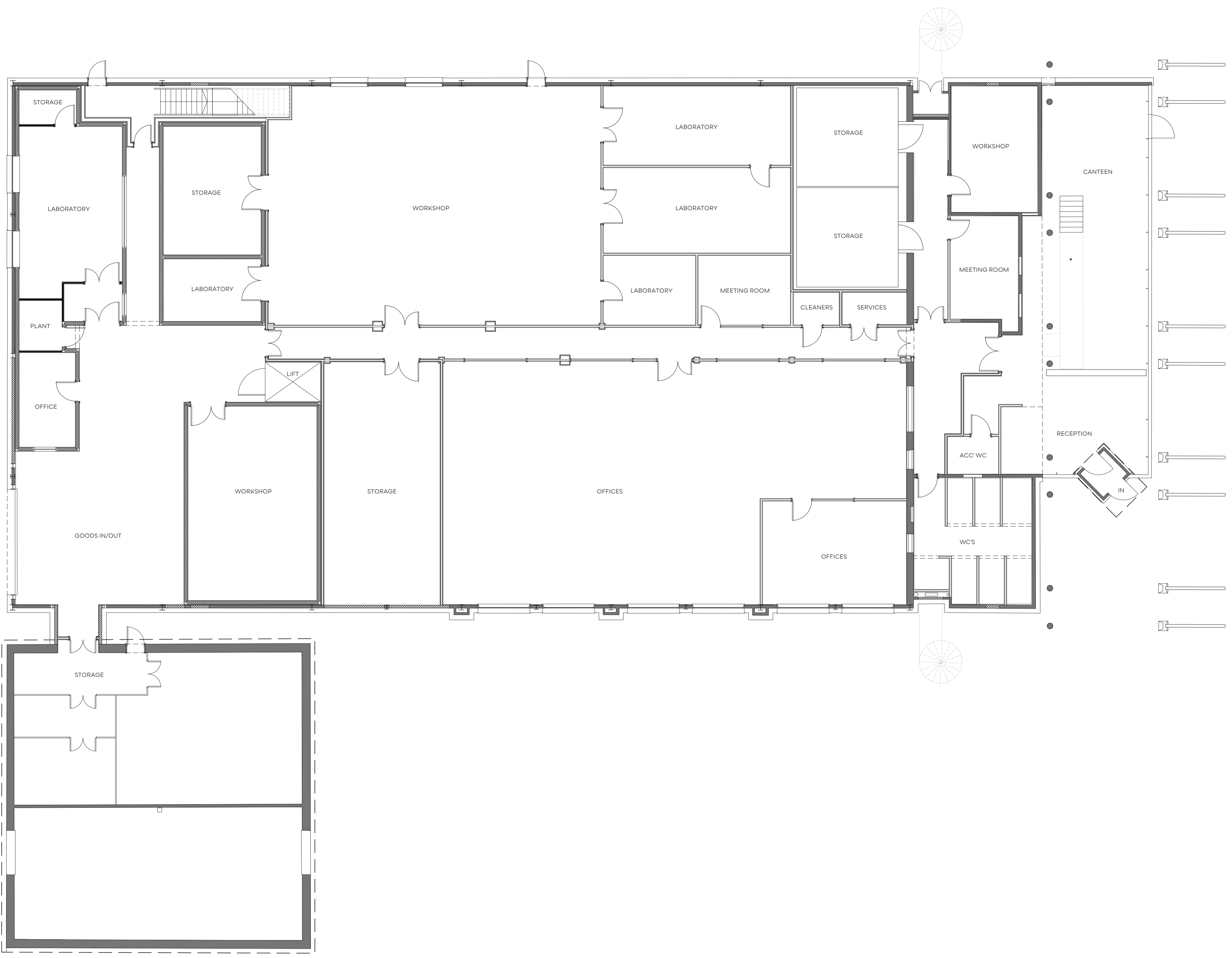
◇ GROUND FLOOR PLAN @ 1:100