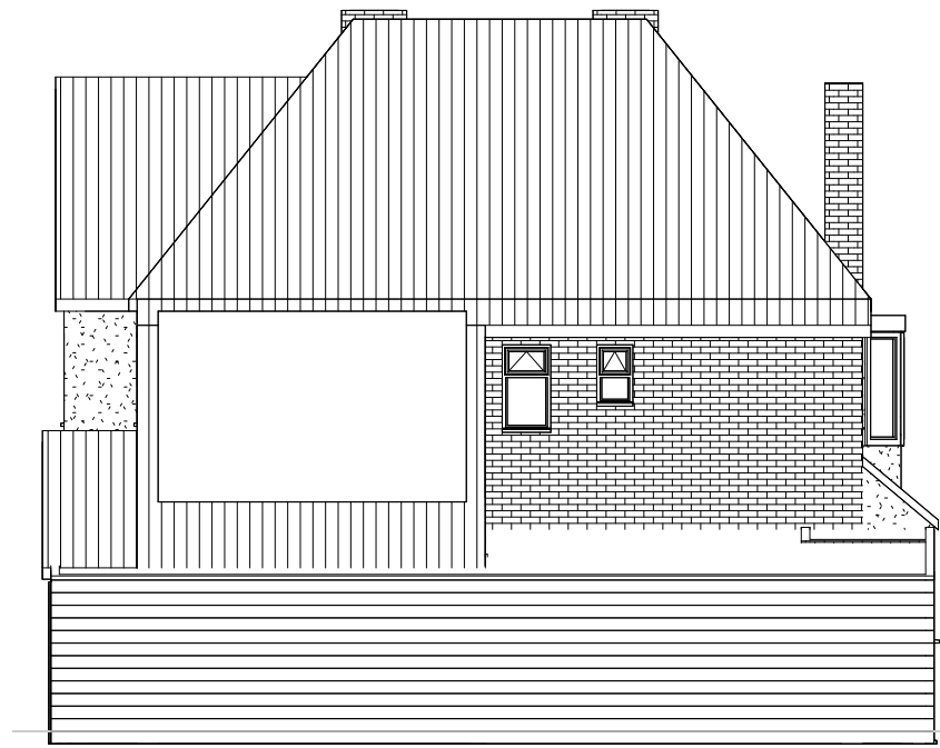
1 Existing Side A Elevation 1 : 100