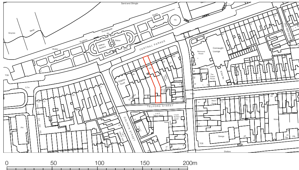
PL 201 /01 Location Plan 1:1250