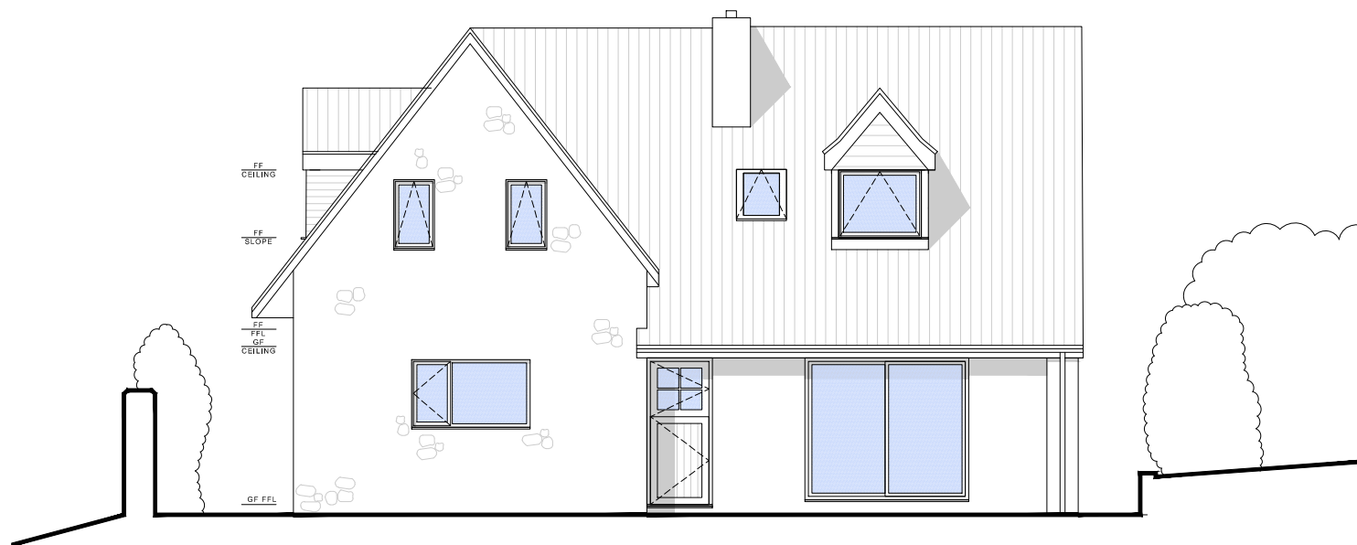
North East Elevation (Rear Garden)