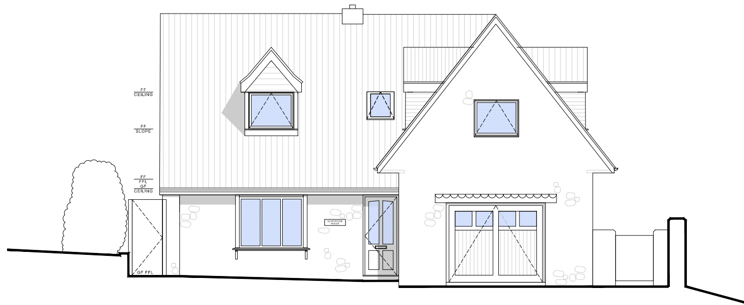
South West Elevation (Driveway)