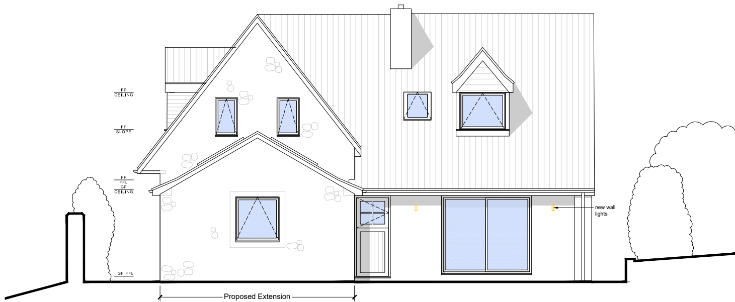
North East Elevation (Rear Garden)