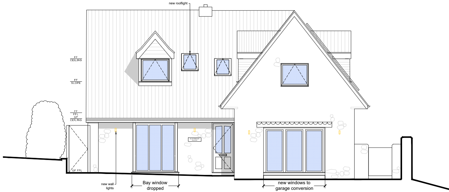
South West Elevation (Driveway)