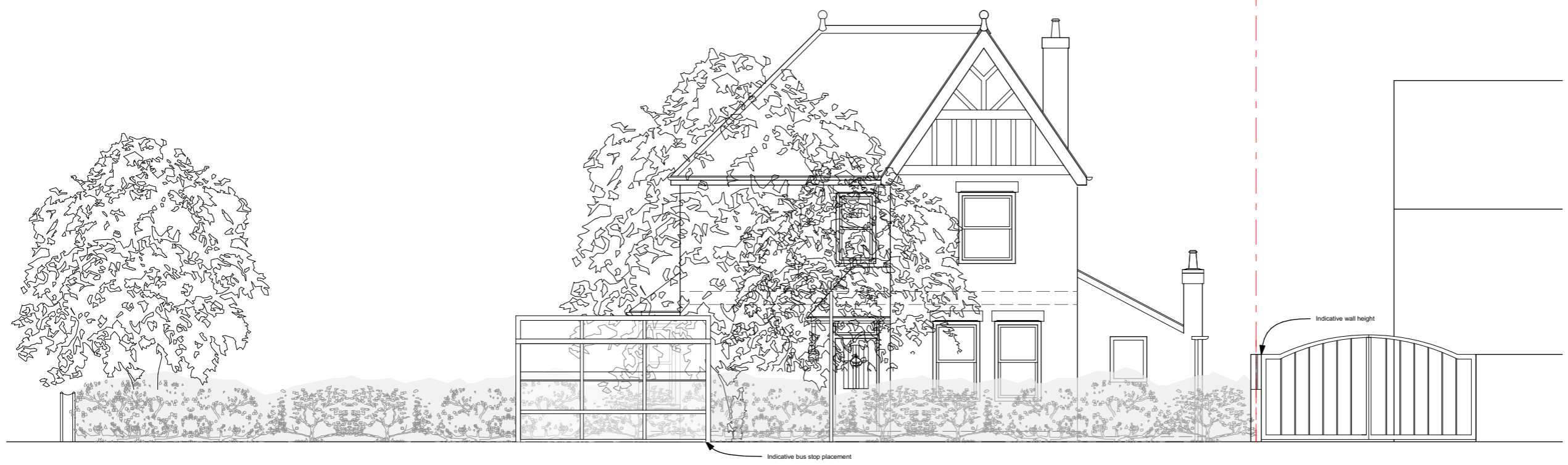
Existing Street Elevation Scale 1:100

CDM Regulations, require all projects to: - Have workers with the correct skills, knowledge, training and experience. - Contractors providing appropriate supervision, instruction and information. - A written Construction Phase Plan. Swain Architecture are appointed as 'Designer' only, unless appointed by the client in writing to confirm Swain Architecture's role as 'Principal Designer'.