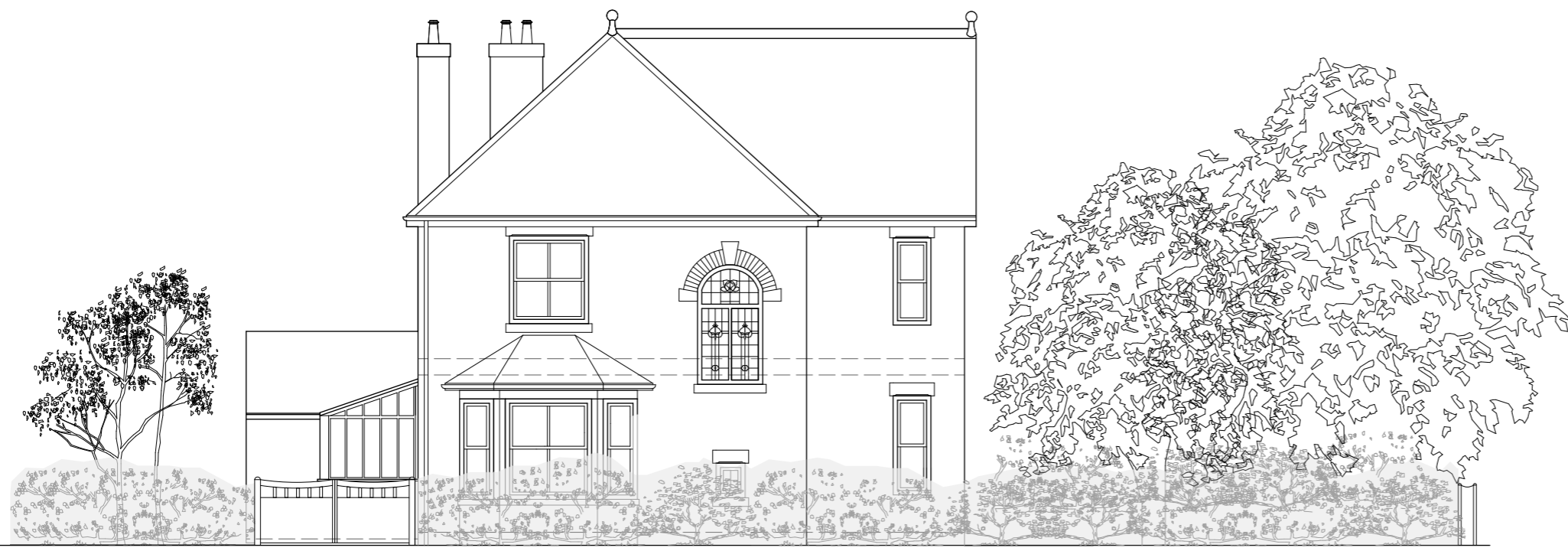
Existing Street Elevation Scale 1:100

Notes: Copyright retained in accordance with the copyright design and patents act 1988. Dimensions must not be scaled from this drawing. The contractor is to check and verify all building and site dimensions before work is commenced. The Contractor is to check and verify with all Statutory Authorities and Employer the local and condition of any underground or overhead services or confirm that none exist prior to work commencing on site.