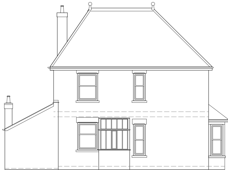
Existing Rear Elevation Scale 1:100