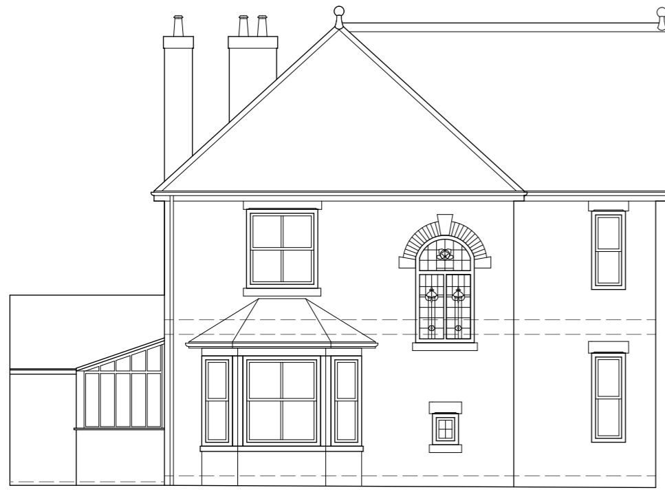
Existing Side Elevation Scale 1:100