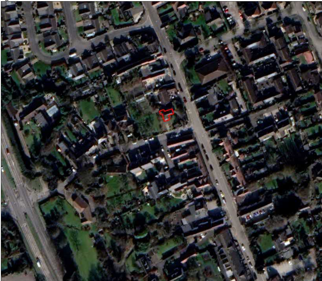
Figure 1.1: Site Context