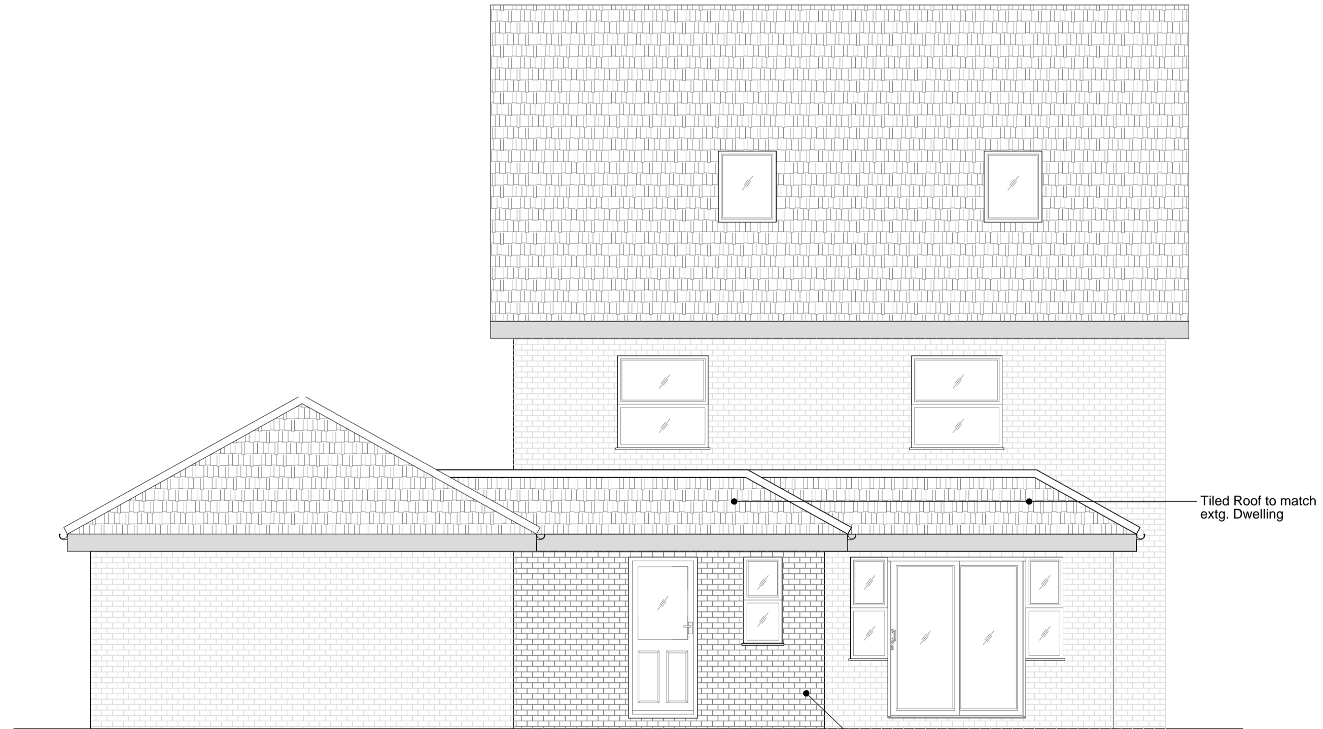
Proposed Rear Elevation (Scale = 1:50)