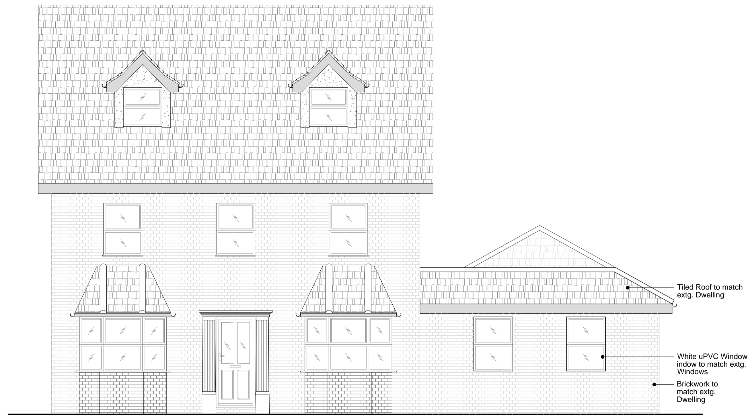
Proposed Front Elevation (Scale = 1:50)