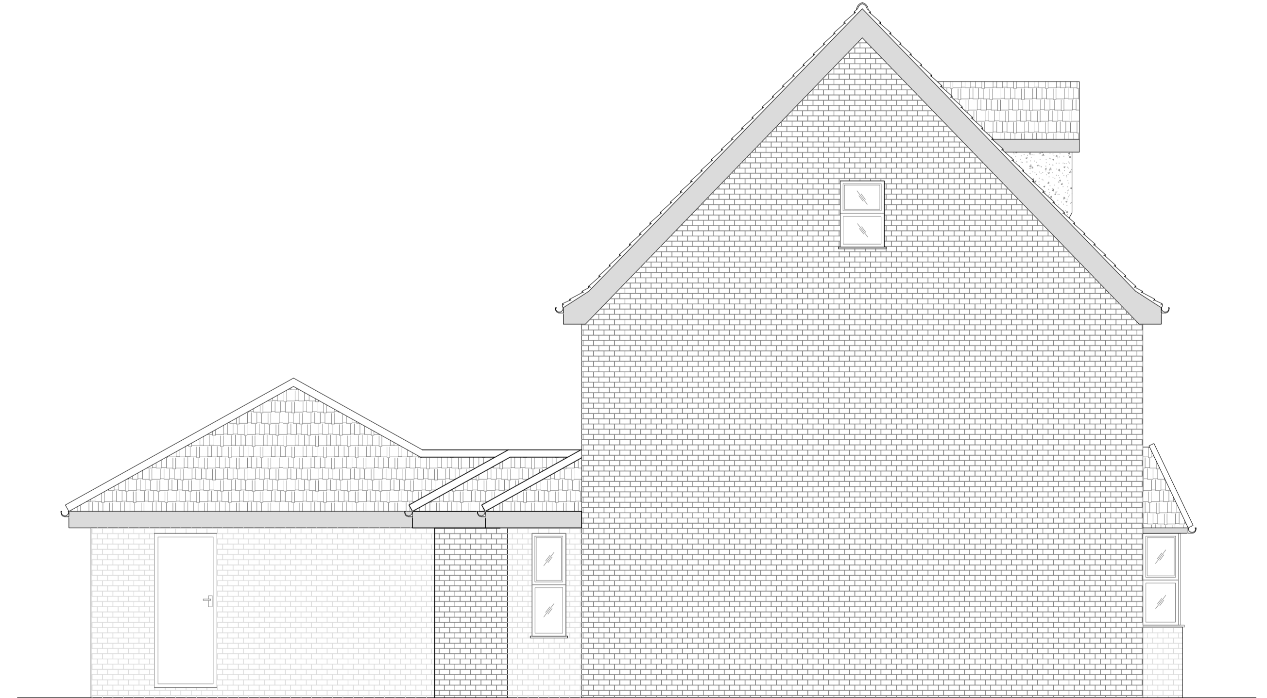
Proposed Right Hand Side Elevation (Scale = 1:50)