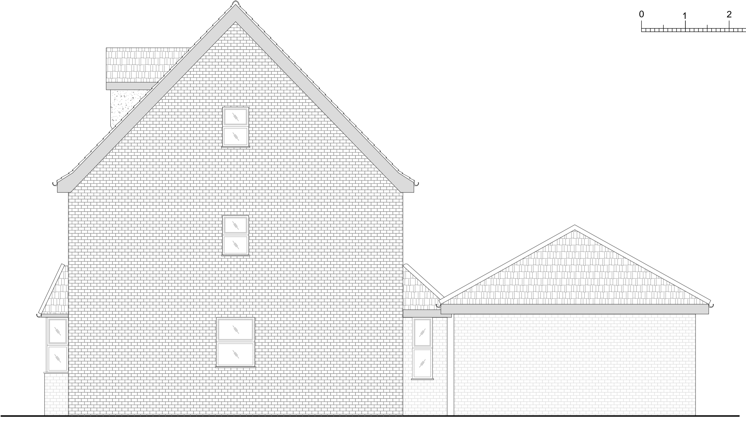
Existing Right Hand Side Elevation (Scale = 1:50)