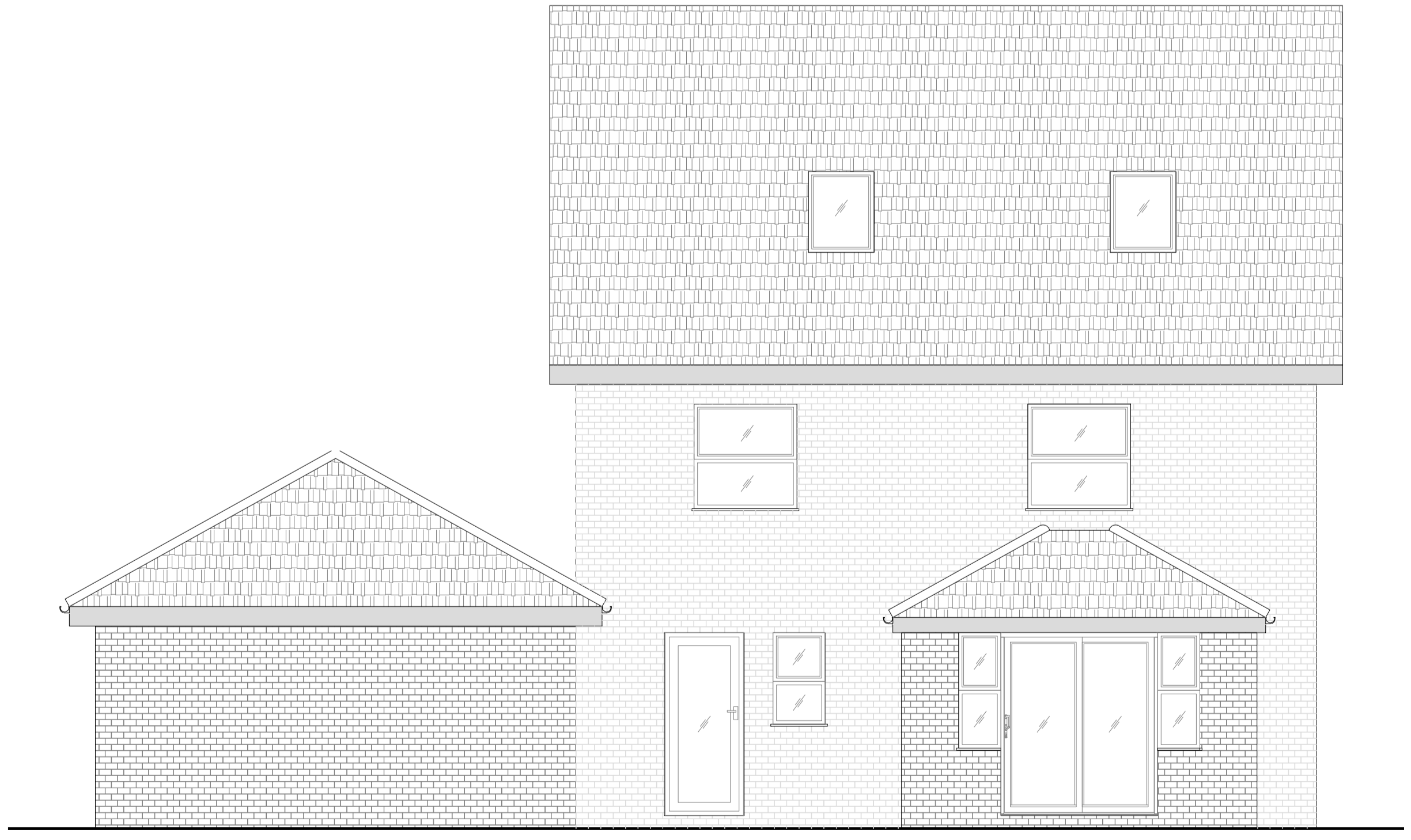
Existing Rear Elevation (Scale = 1:50)