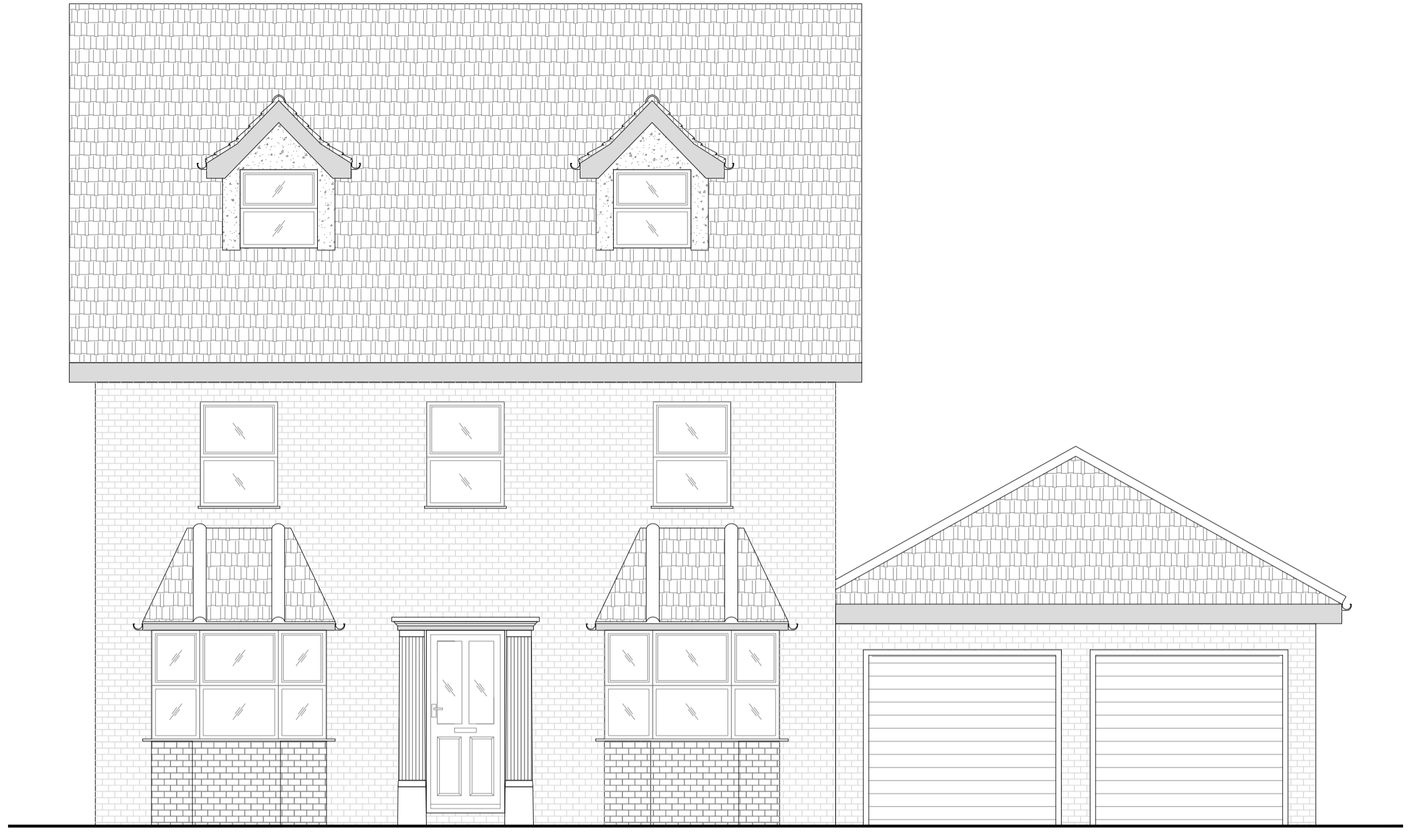
Existing Front Elevation (Scale = 1:50)