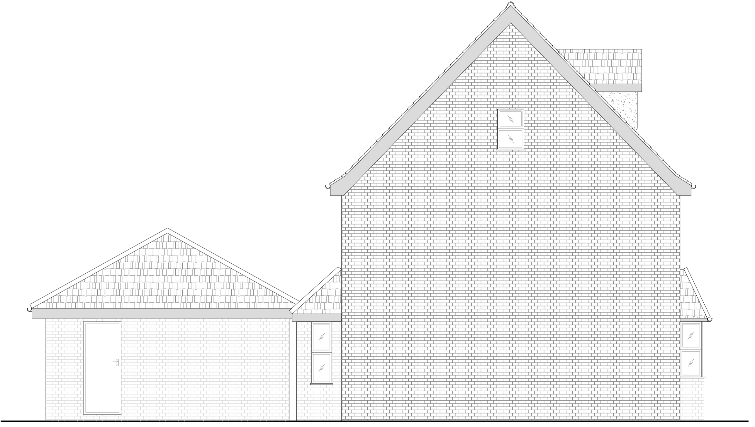
Existing Left Hand Side Elevation (Scale = 1:50)