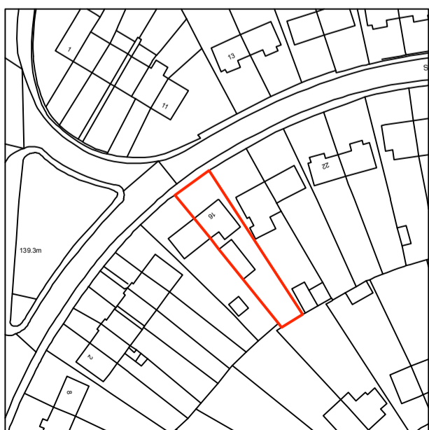
OS MAP Scale 1:1250