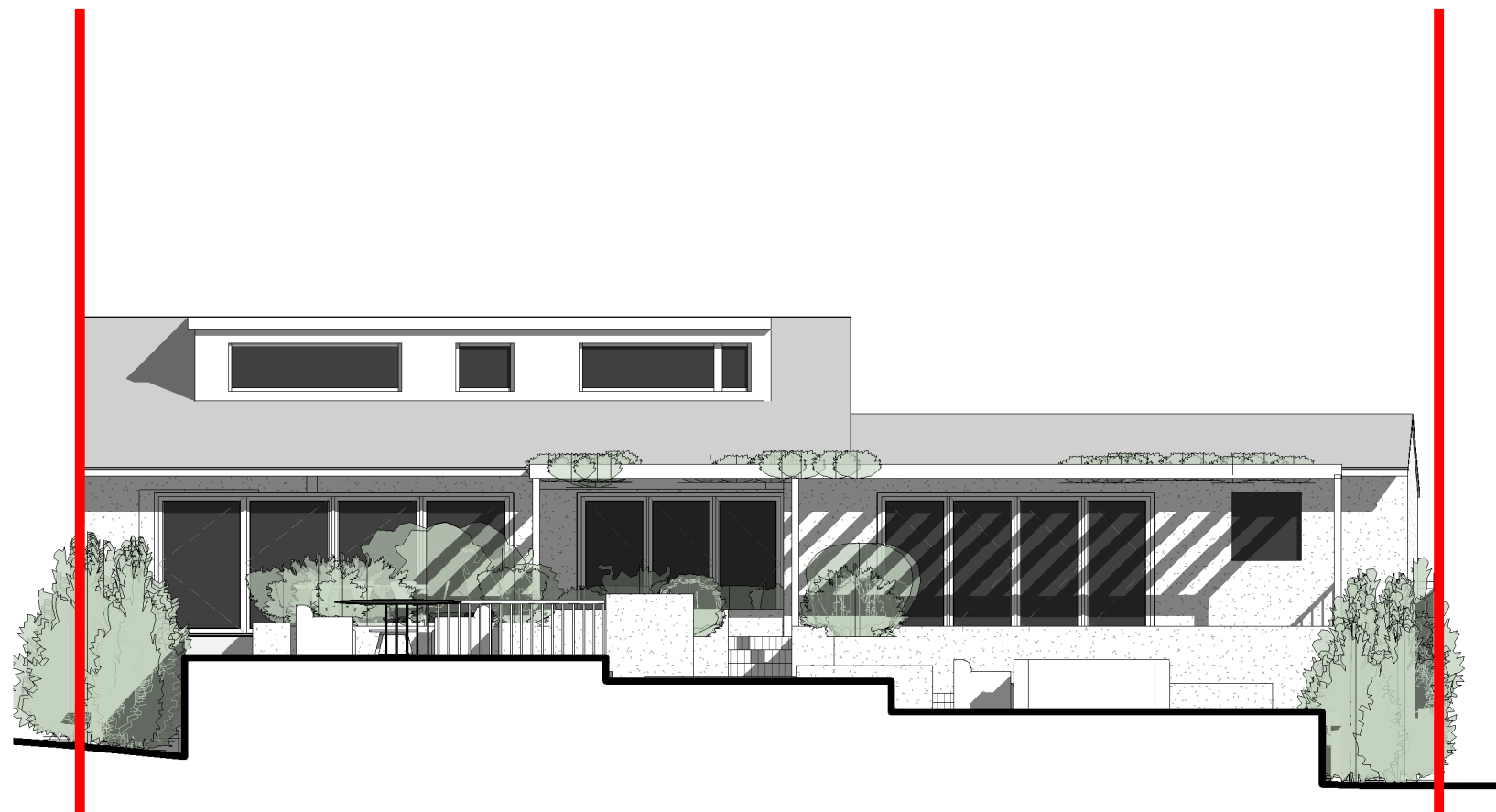
Proposed East Elevation 2 1 : 100