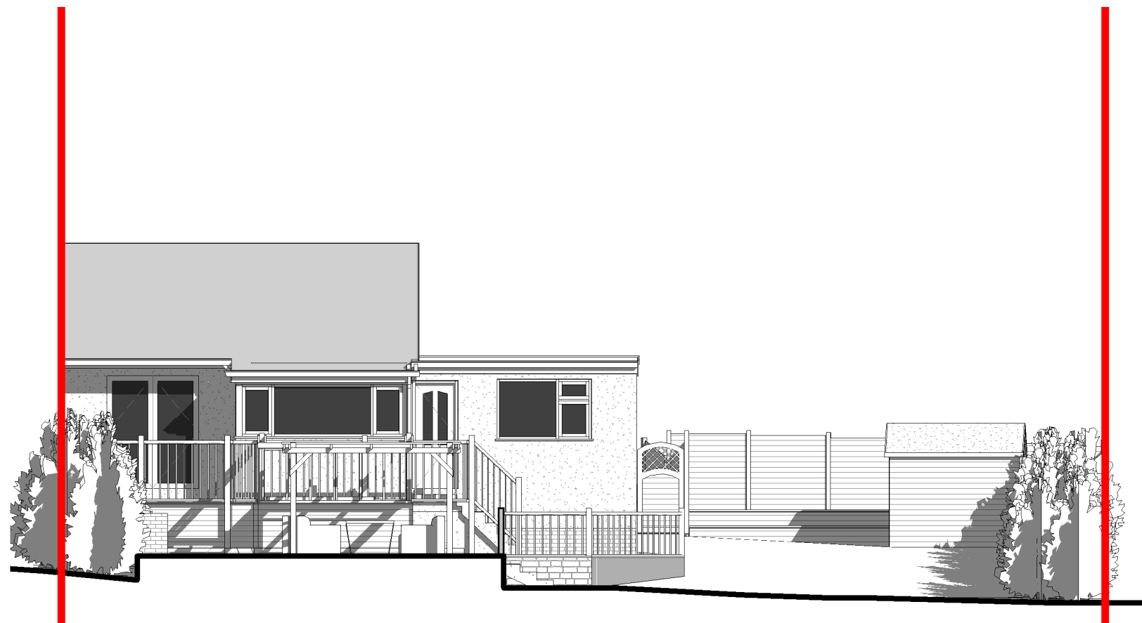
Existing East Elevation 2 1 : 100