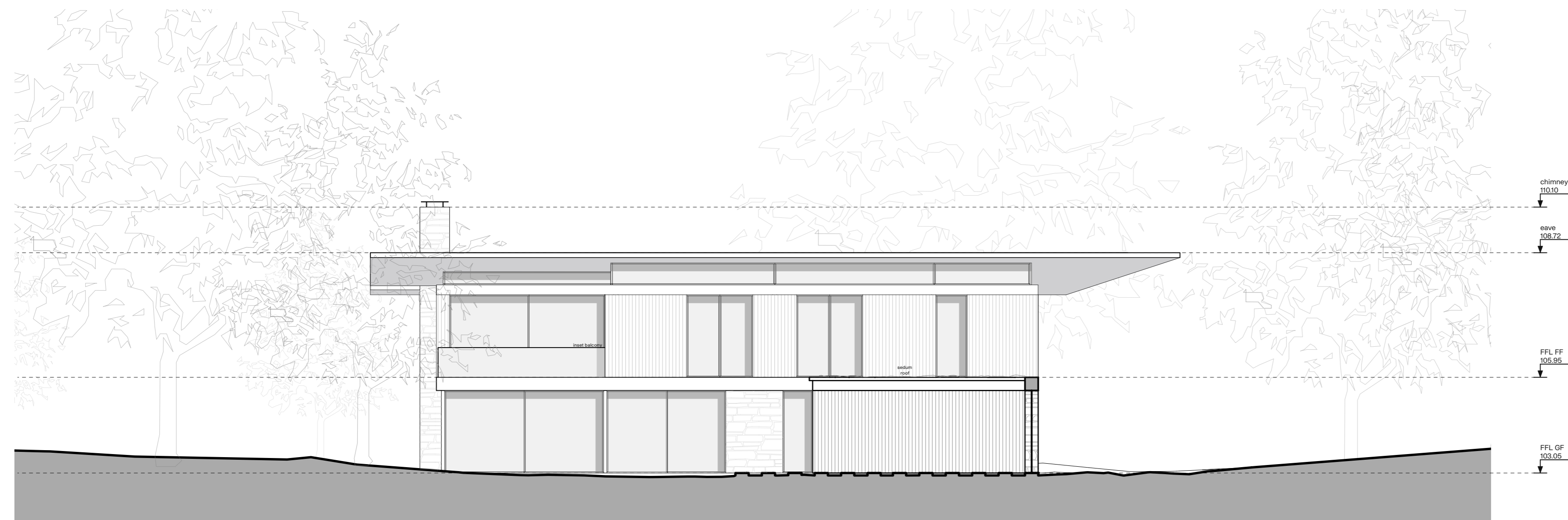
Proposed South Elevation