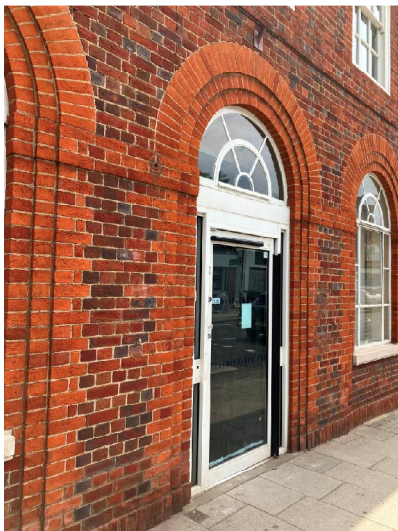
3. Front Elevation – Entrance door & glazed side panels