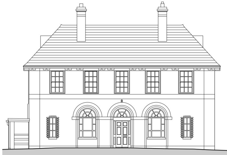
Proposed Front Elevation(not to scale)

The proposal is to remove the existing infill area of brickwork and reinstate a 6 pane window to match the style and proportion of the existing on the opposite side of the front elevation. The surrounding brickwork would be reconstructed flush with the existing external wall, and the decorative brick detail and soldier course of the existing window replicated. A stone cill would be incorporated to match the other Ground Floor windows.