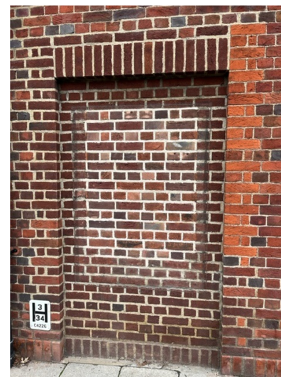
2. Front Elevation – recessed infill brickwork