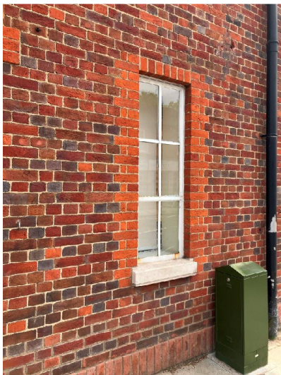
1. Front Elevation – Ground Floor 6 pane window.