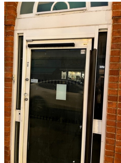
4. Front Elevation – Entrance door & glazed side panels