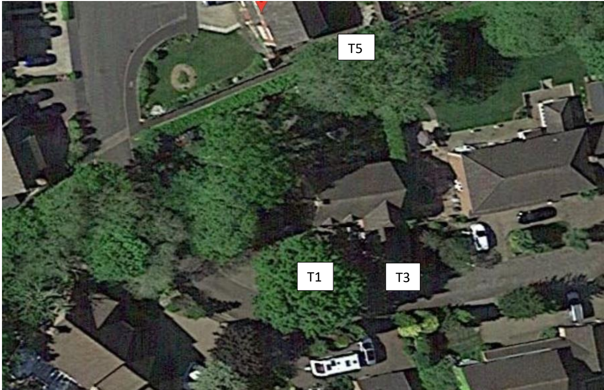
MAP OF TREE LOCATIONS 7 Beechlands Taverham NR86XZ