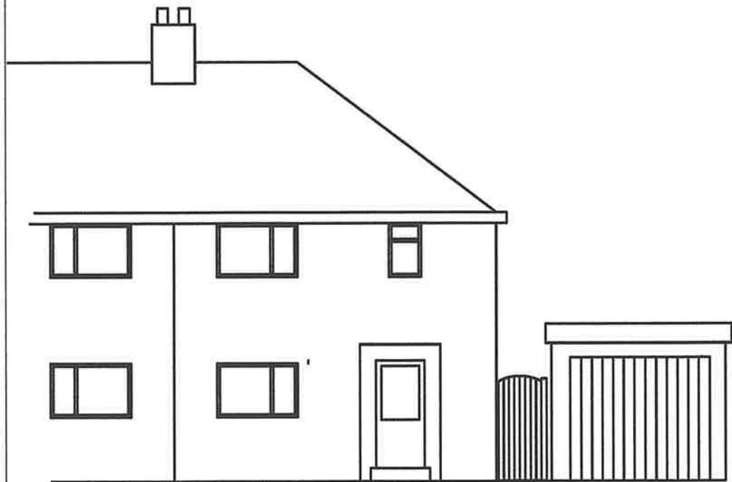
S. W. Facing elevation