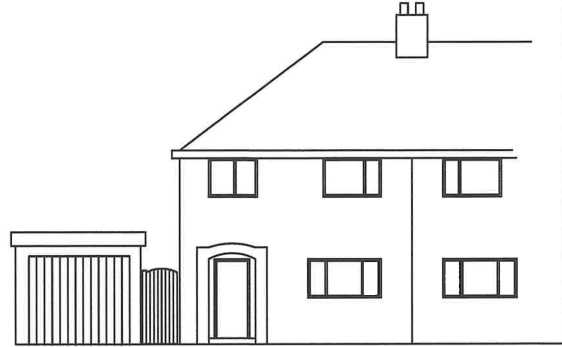
N. E. Facing elevation