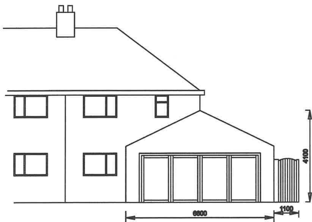
S. E. Facing elevation