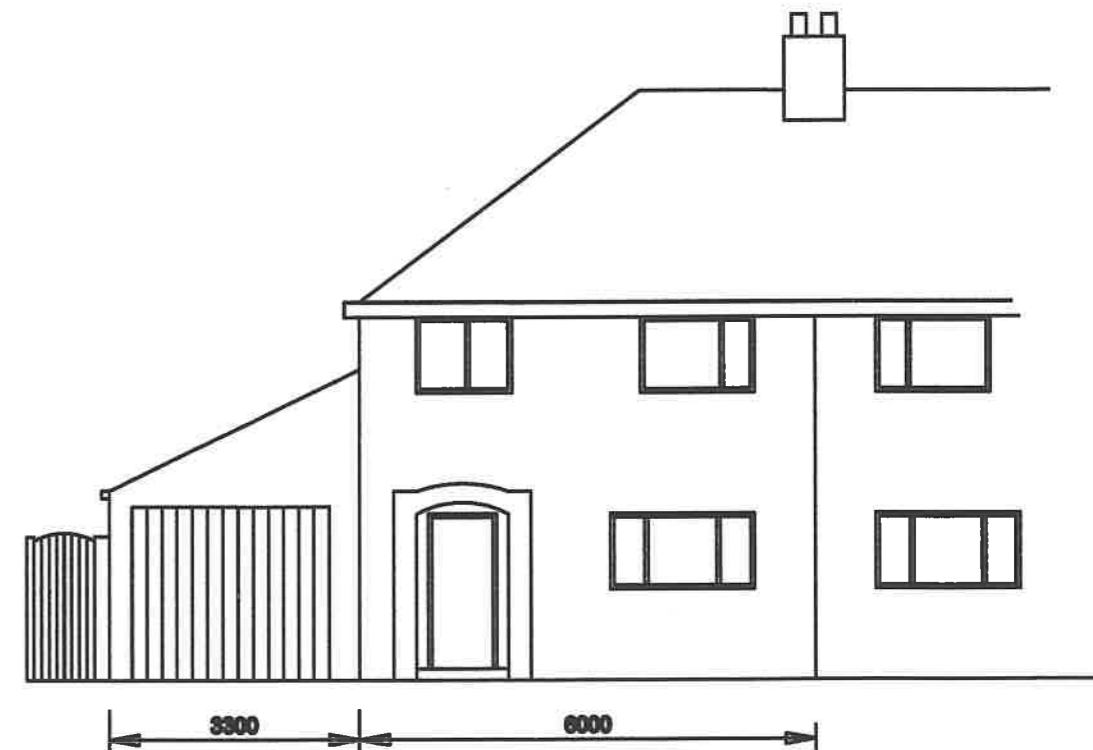
N. E. Facing elevation