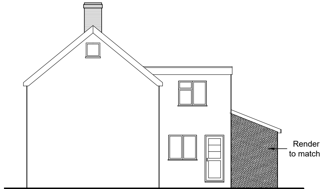
PROPOSED SIDE ELEVATION SOUTH Scale 1:100