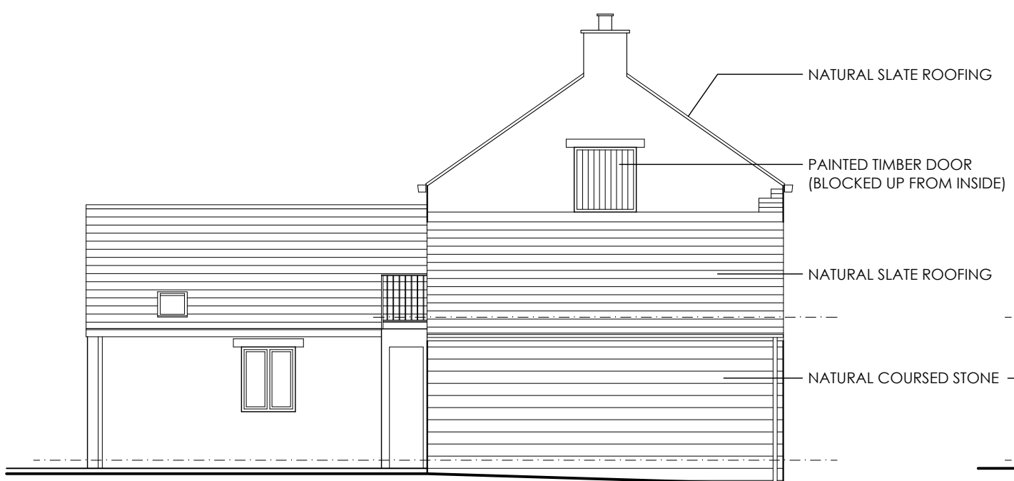
EXISTING SOUTH EAST ELEVATION