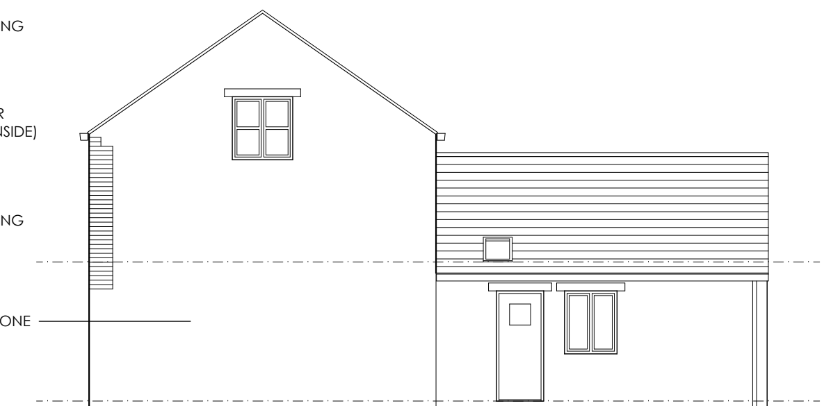
EXISTING NORTH WEST ELEVATION

REV A - 31.10.23 Omission of door to garage and provision of window to new gable on SE elevation, to reflect 'as built'.