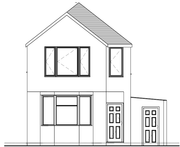
Proposed Front Elevation 1 : 100

ANY WORK COMMENCING BEFORE APPROVALS HAVE GRANTED IS AT THE RISK OF THE CLIENT AND THE BUILDER..