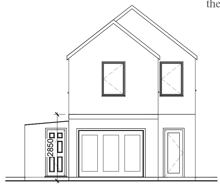
Proposed Rear Elevation 1 : 100

Obscured Glazed windows to be provided to the Gable End, Fixed up to 1.7m from the finished floor level.