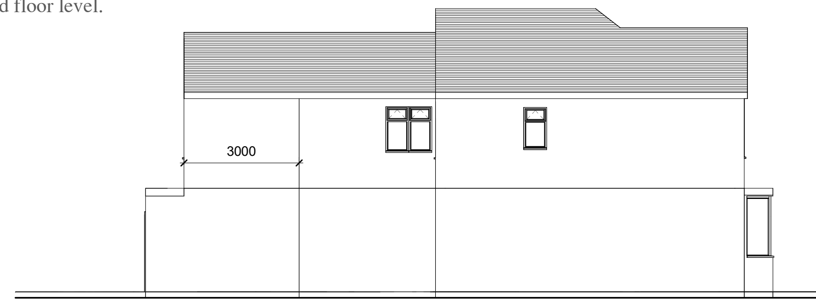
Proposed Side Elevation II 1 : 100

The external materials of the proposed extension would match the external materials of the original dwelling house