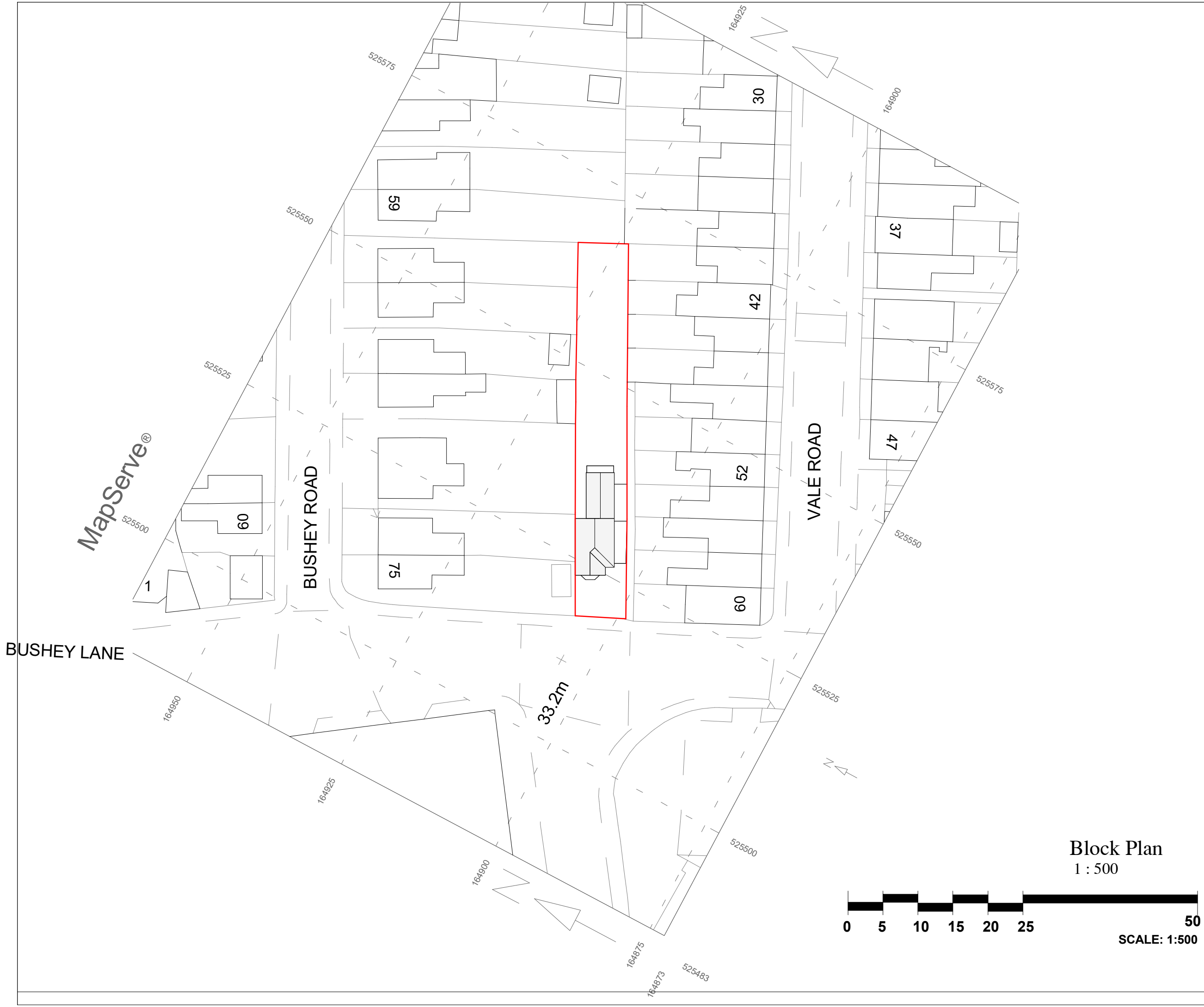
Block Plan 1 : 500