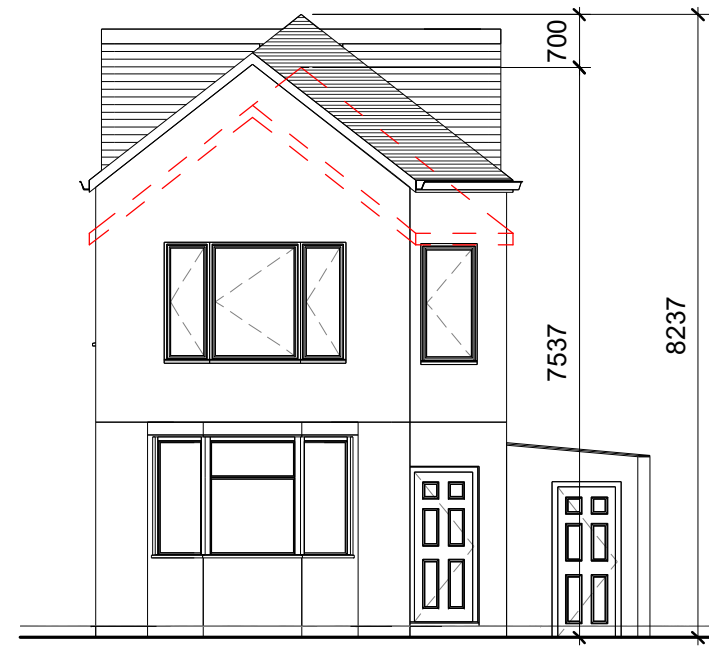
Proposed Front Elevation 1 : 100

ANY WORK COMMENCING BEFORE APPROVALS HAVE GRANTED IS AT THE RISK OF THE CLIENT AND THE BUILDER..