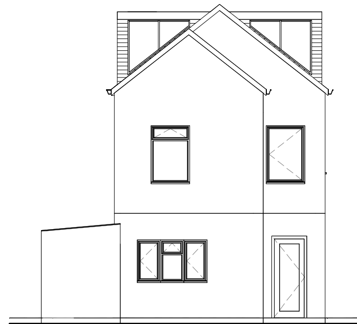
Proposed Rear Elevation 1 : 100