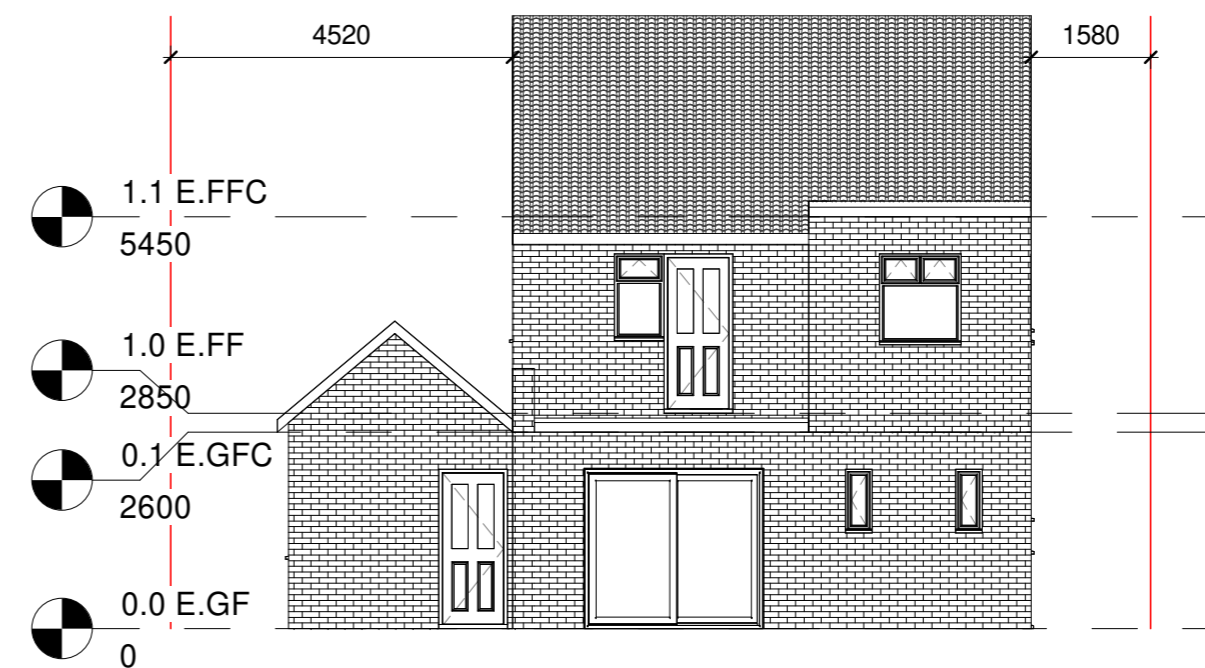
3 E.Rear 1 : 100