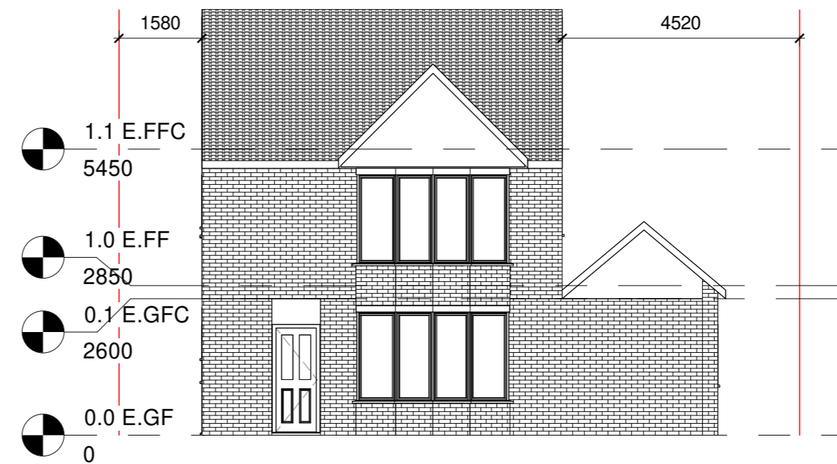
2 E.Front 1 : 100