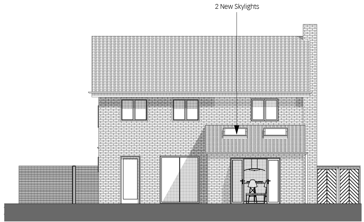
3 Rear Elevation 1:100