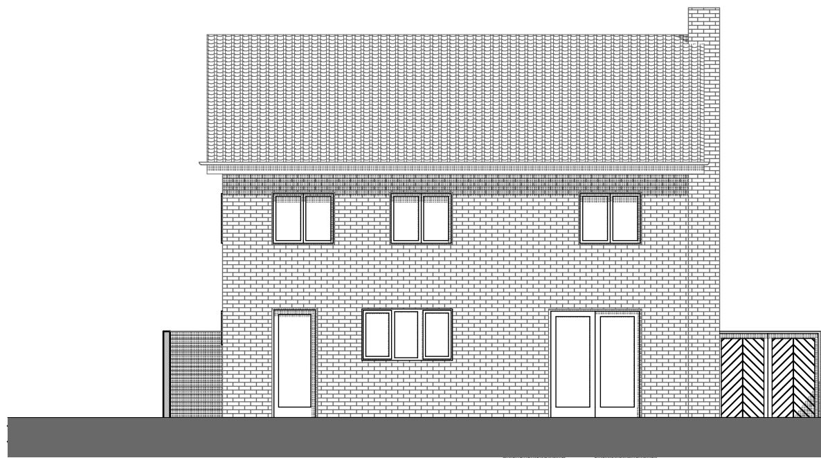
3 Rear Elevation 1:100