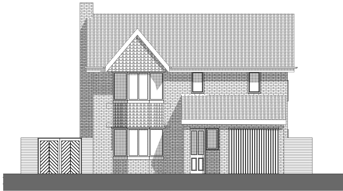
1 Front Elevation 1:100