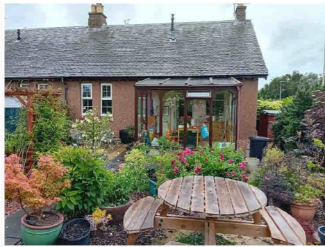
Existing Rear Photo