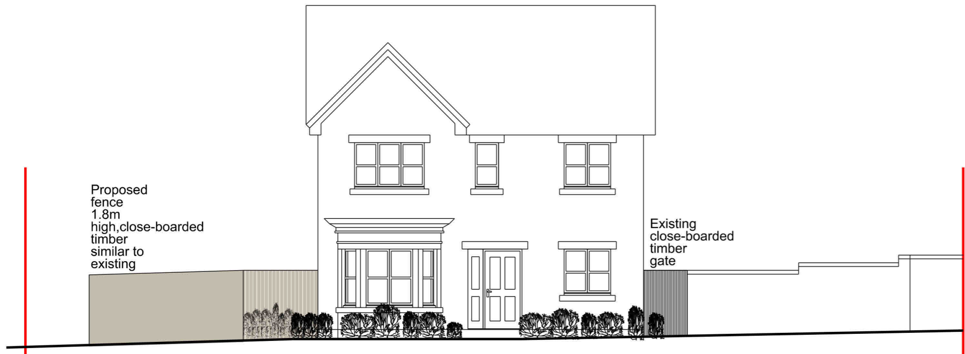
Neatoune Drive Elevation