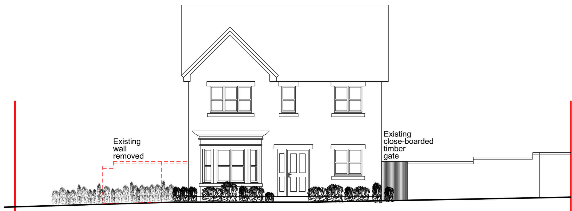
Neatoune Drive Elevation