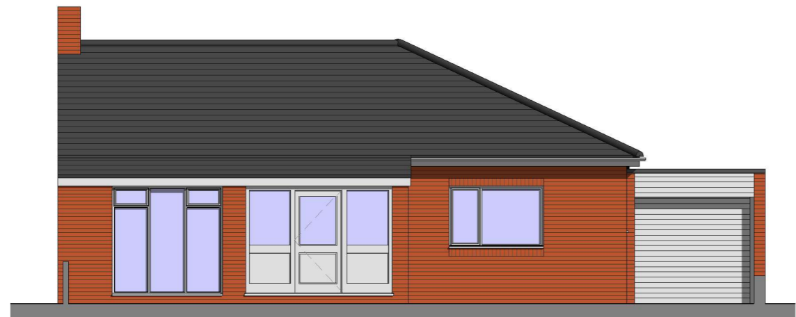
1 Front Elevation 1:100