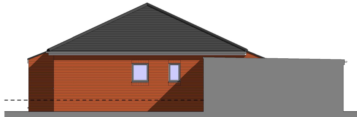
2 Side Elevation 1:100