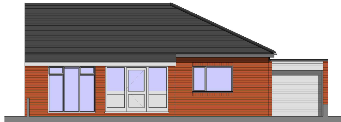
1 Front Elevation 1:100