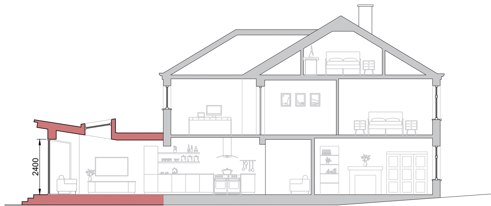
Proposed Section C-C