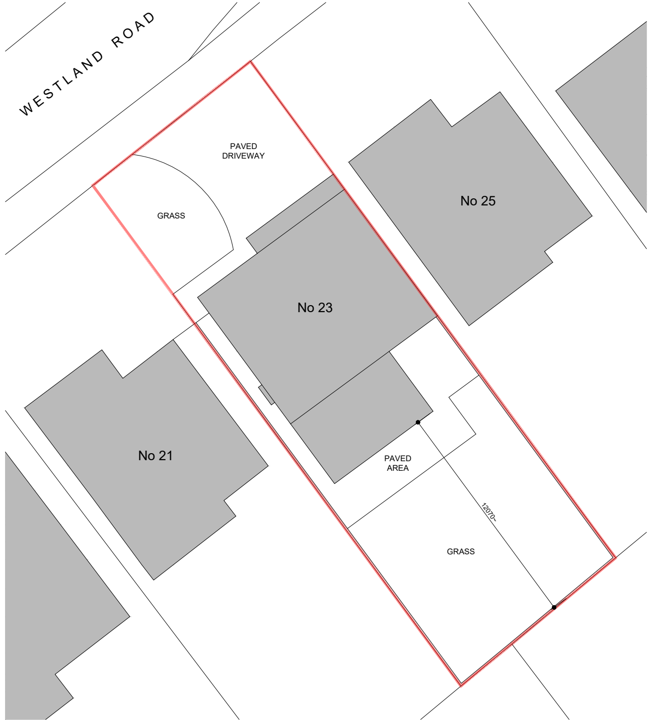
EXISTING SITE / BLOCK PLAN