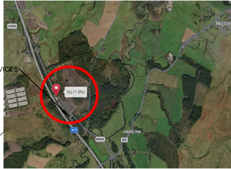
Aerial View nts