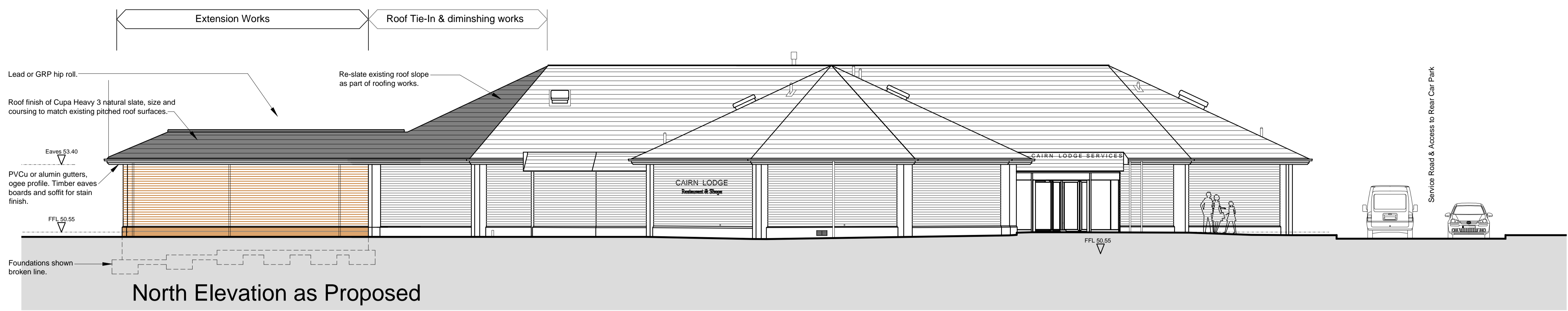
North Elevation as Proposed