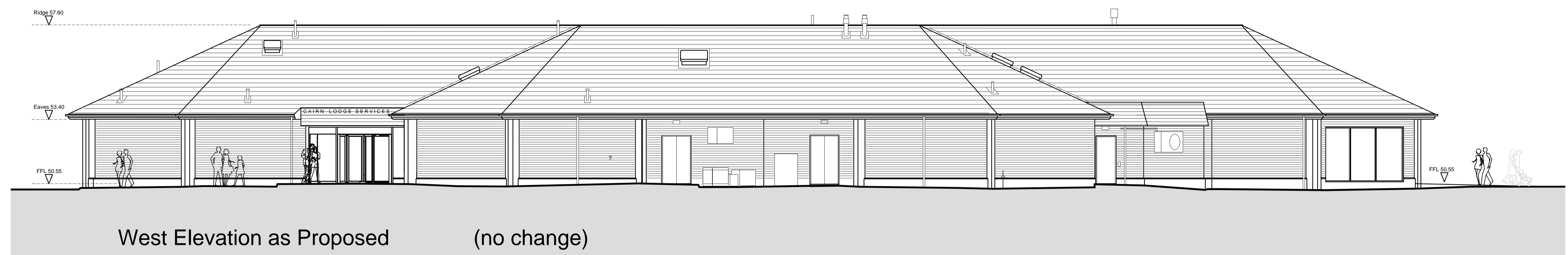
West Elevation as Proposed (no change)