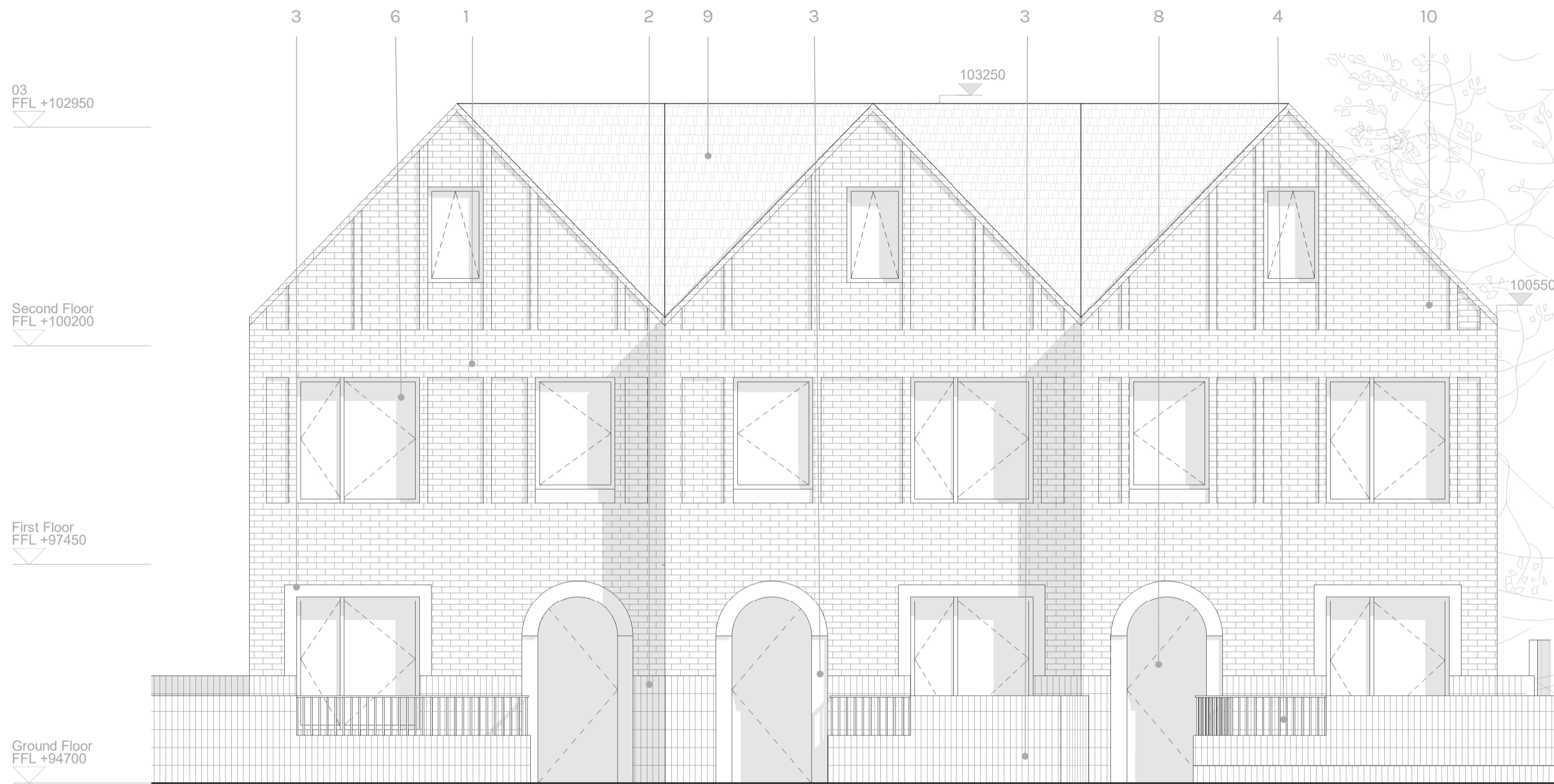
1 | Unit 1-3 Proposed North Elevation 1:50