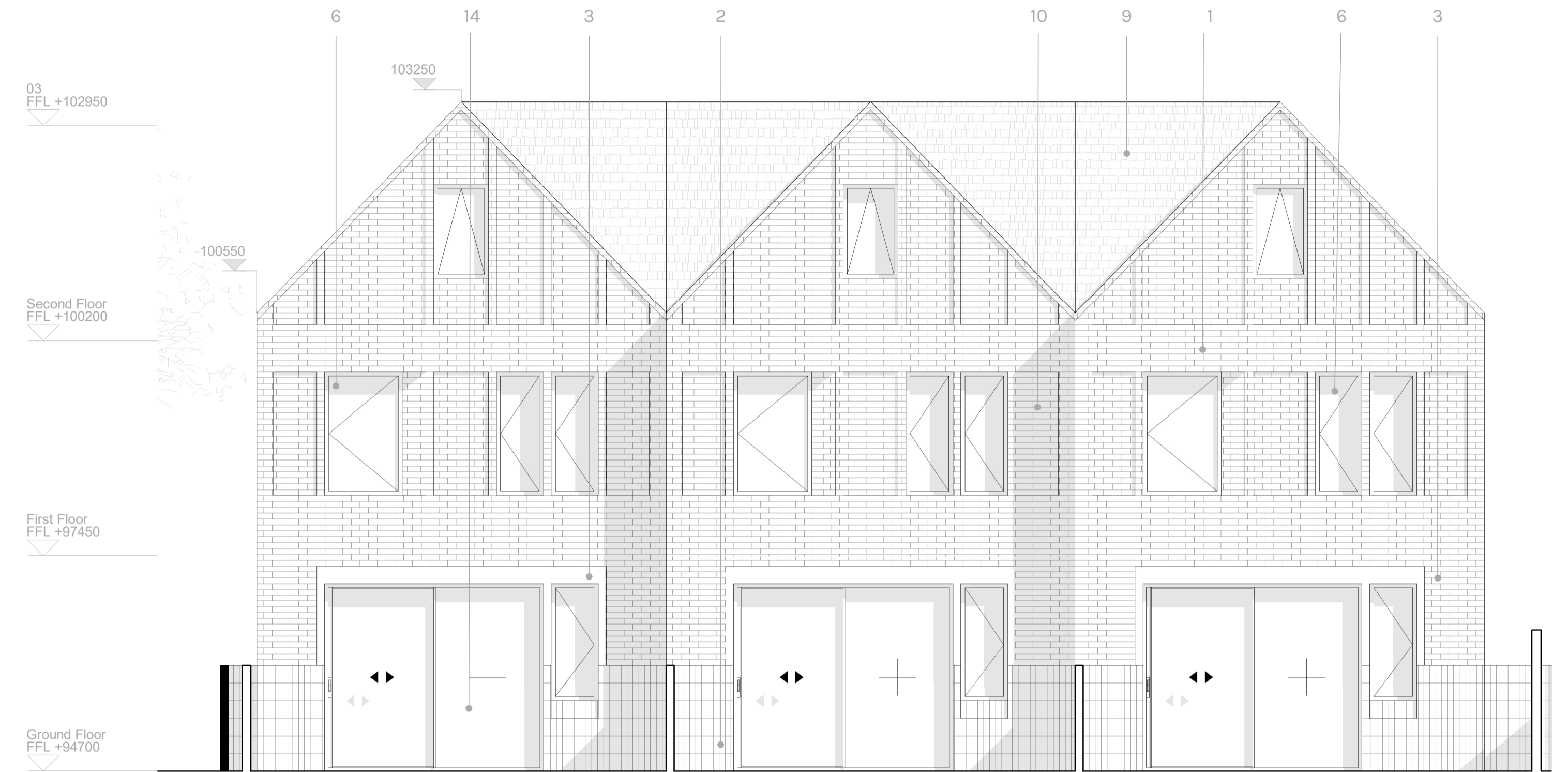
2 | Unit 1-3 Proposed Proposed South Elevation 1:50