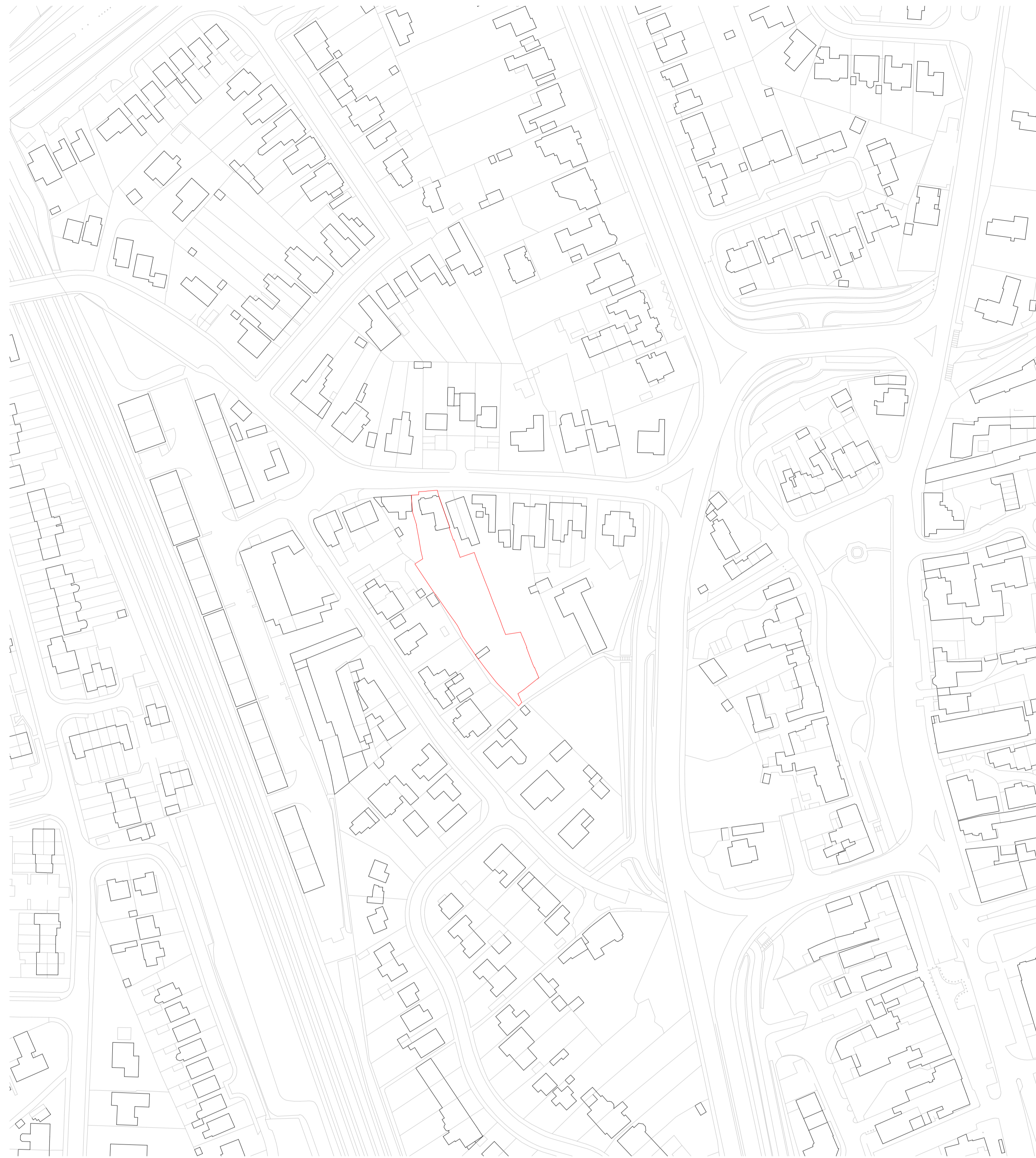
1 Location Plan 1:1250