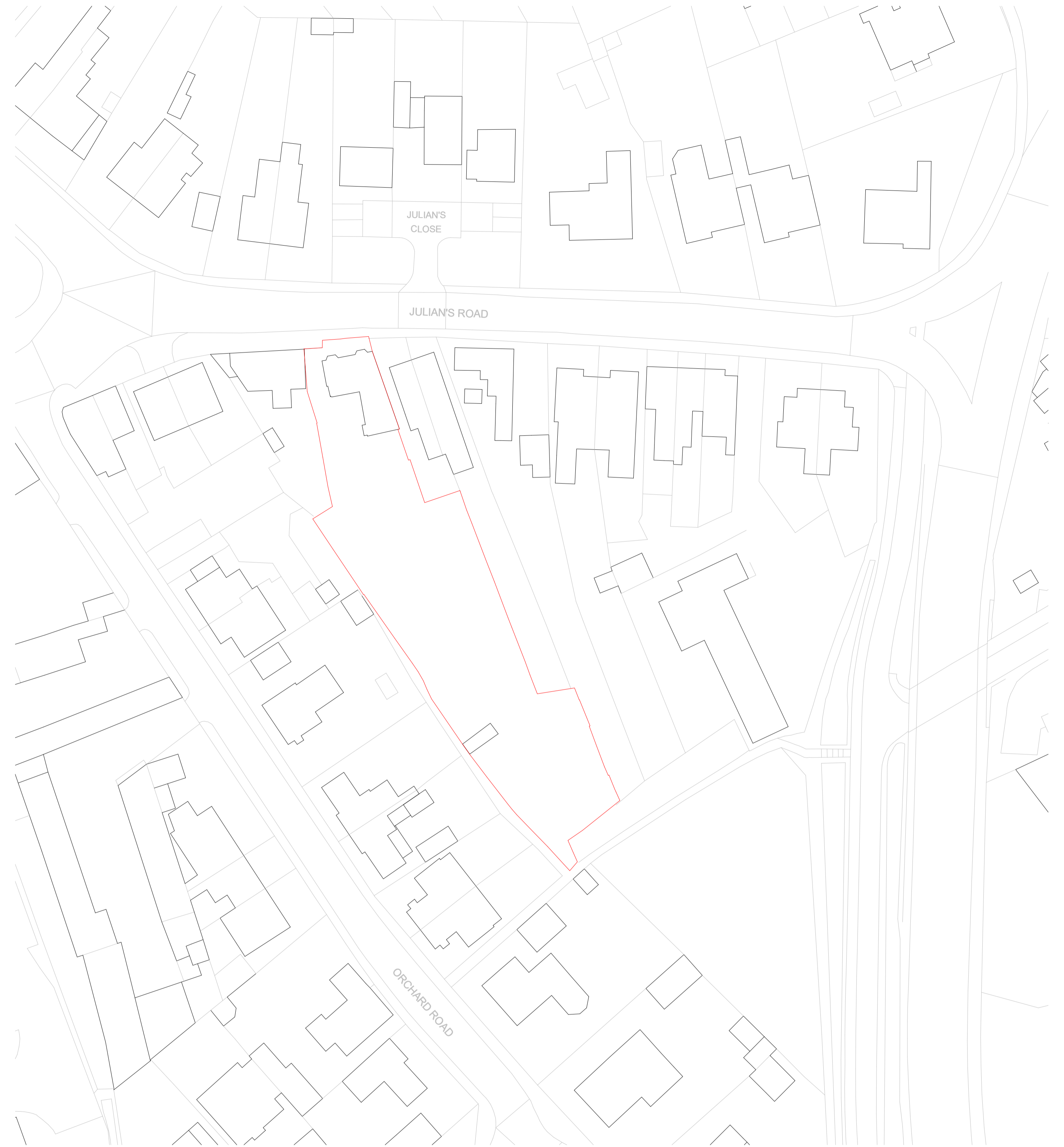
2 Block Plan 1:500