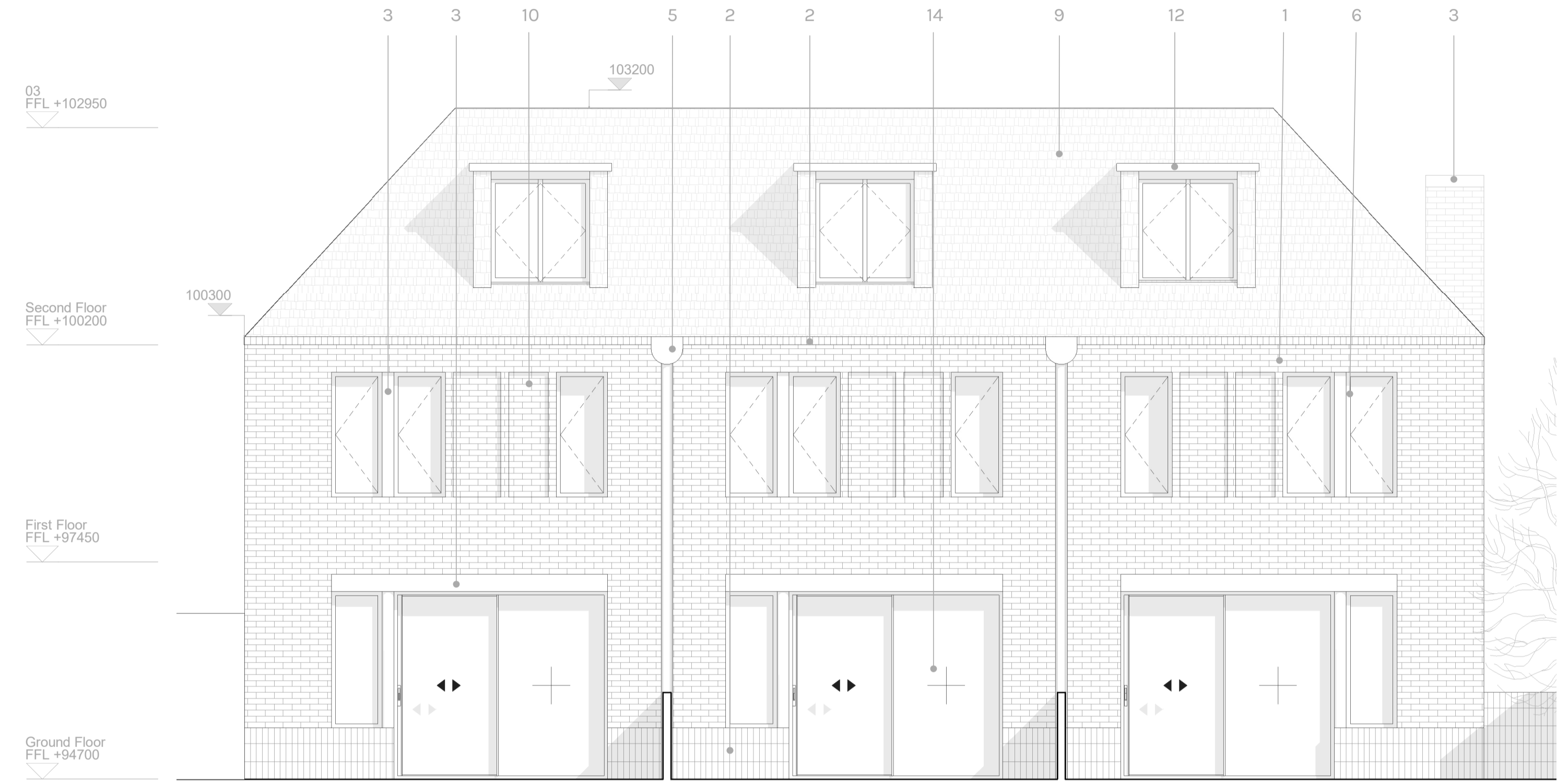
2 | Unit 4-6 Proposed South Elevation 1:50