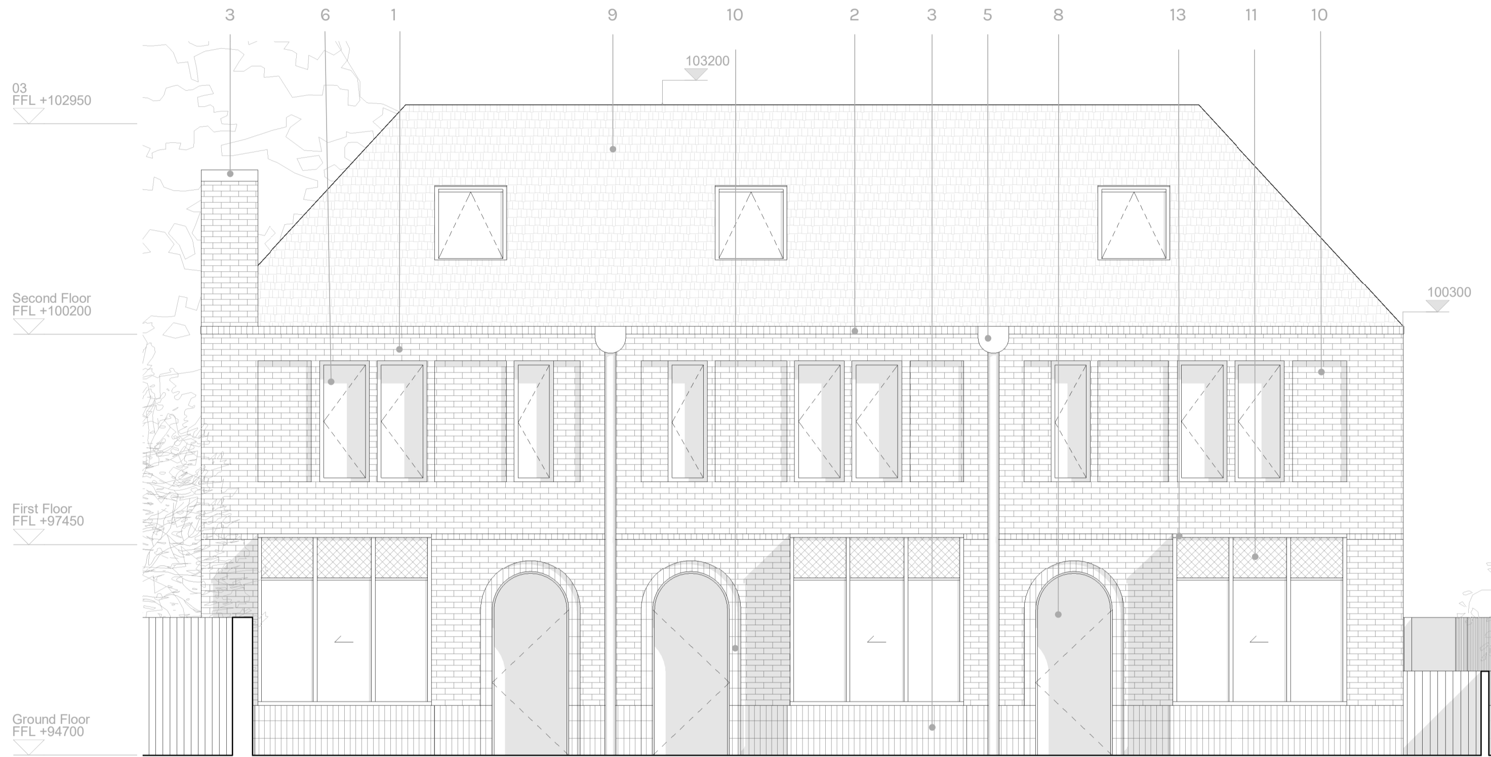
1 | Unit 4-6 Proposed North Elevation 1:50