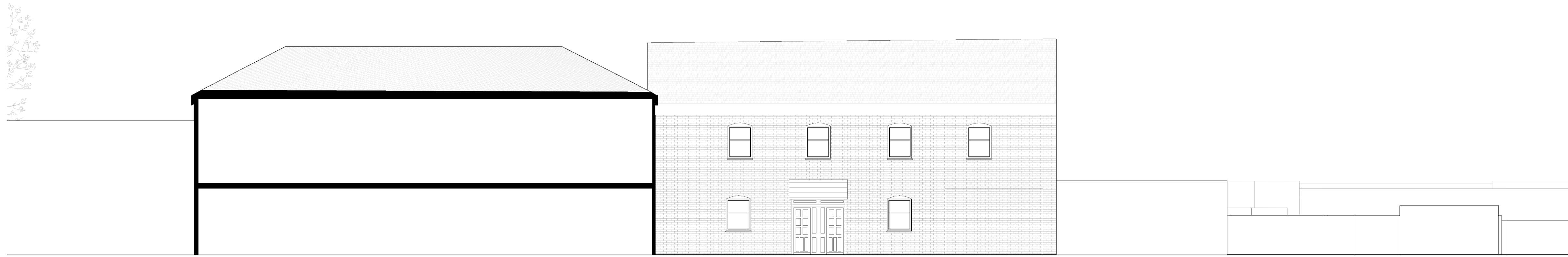
1 Existing Section A-A 1:100