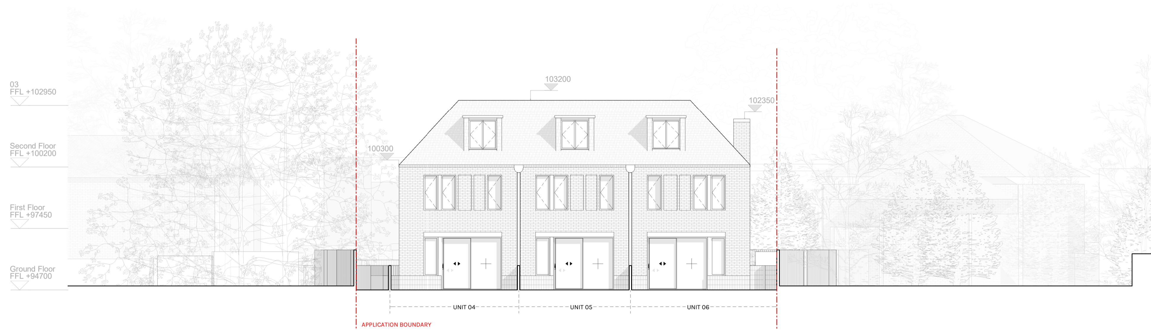
2 Proposed South Elevation 1 : 100