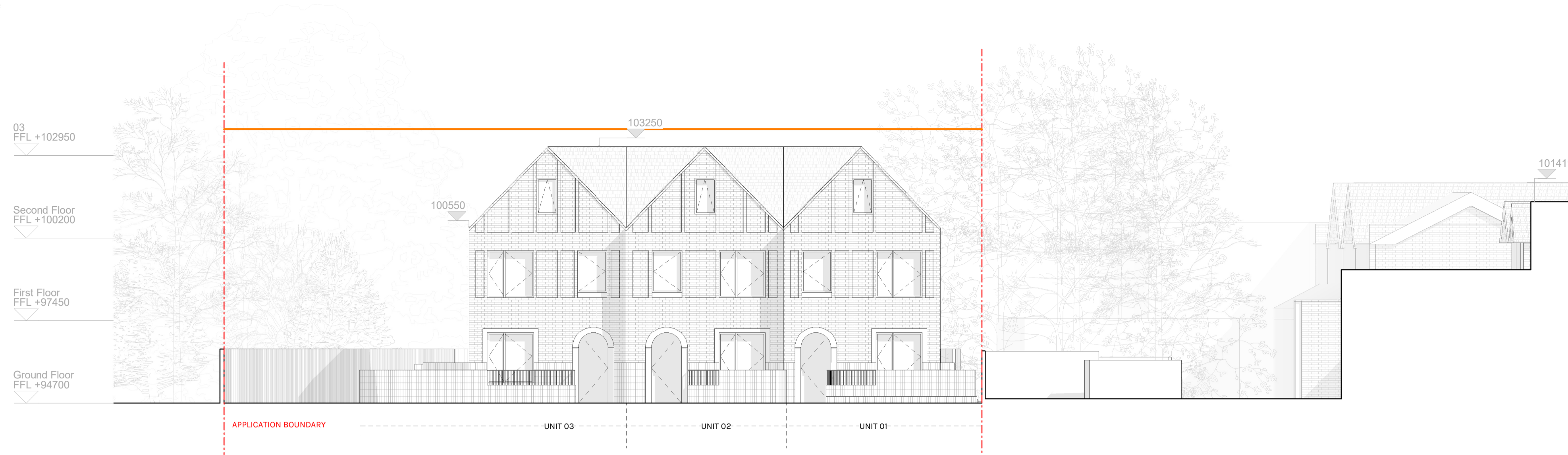
1 Proposed North Elevation 1 : 100

Key — Height of Existing Building Ridge Line