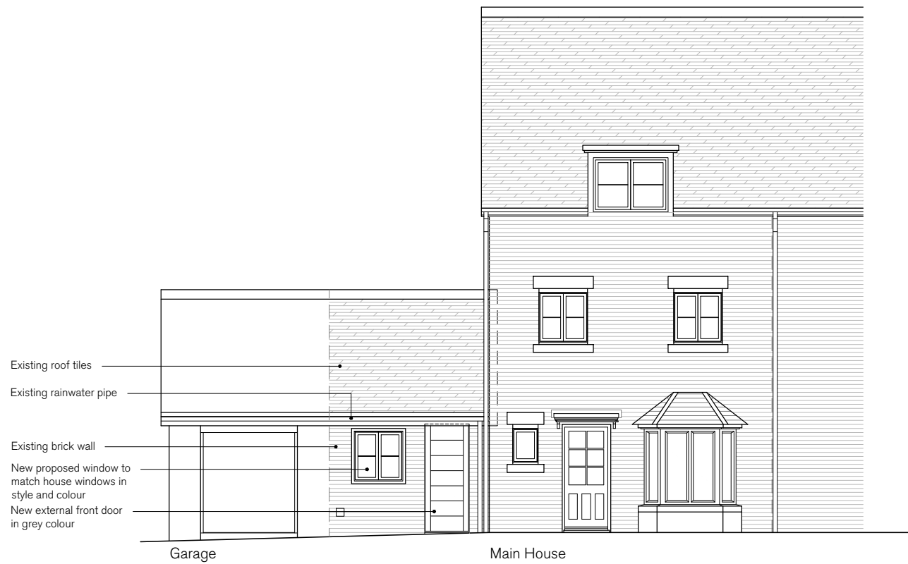
Proposed Garage - Elevation A 1:100