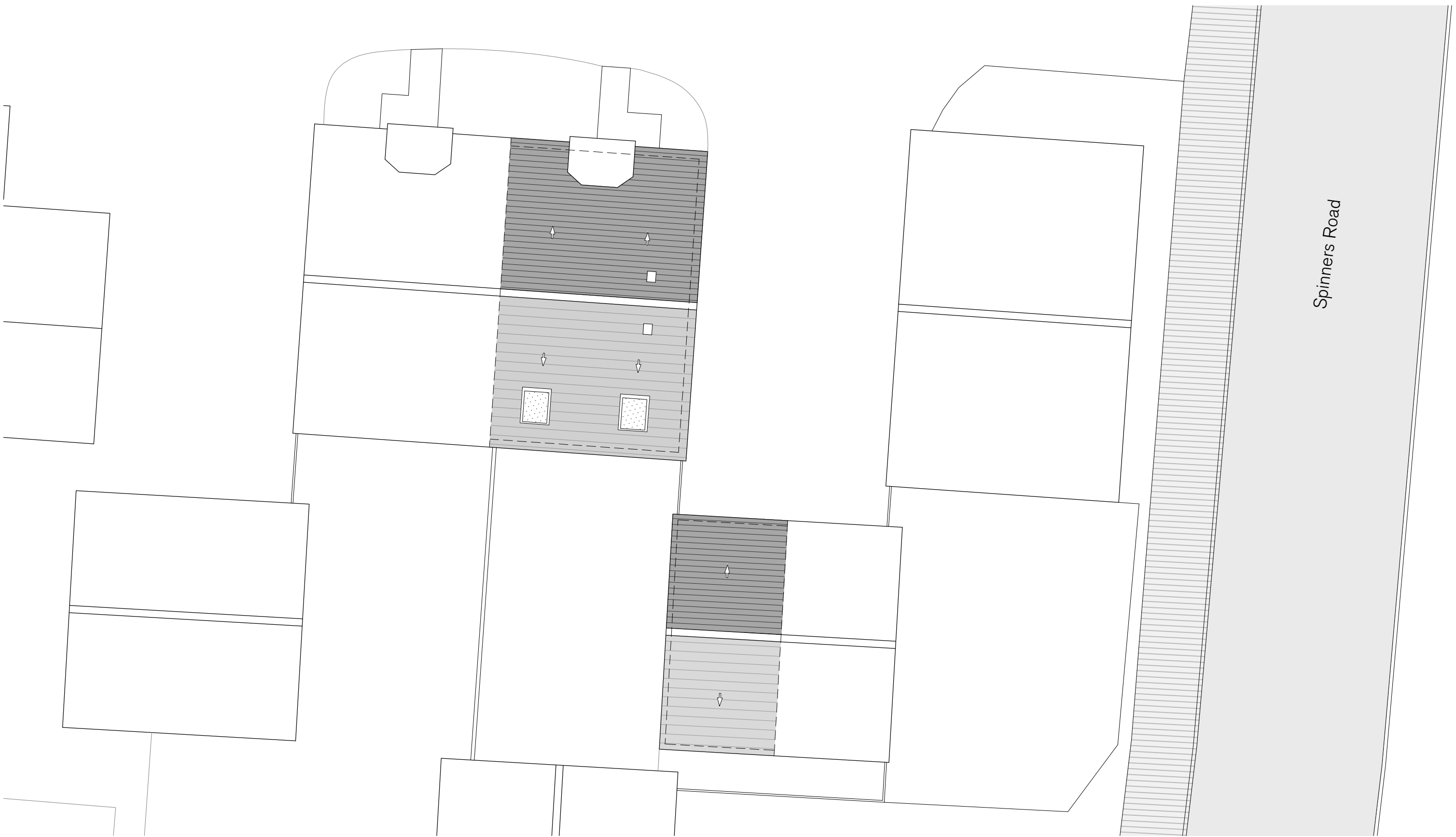
Existing & Proposed Site Plan