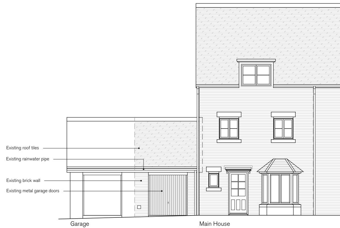
Existing Garage - Elevation A 1:100