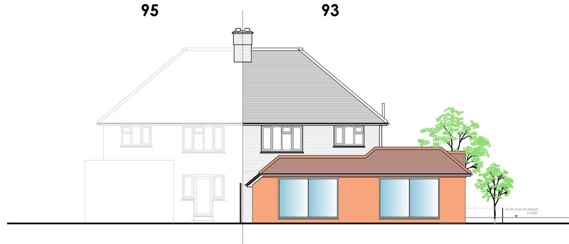
PROPOSED SOUTH (REAR) ELEVATION 1:100