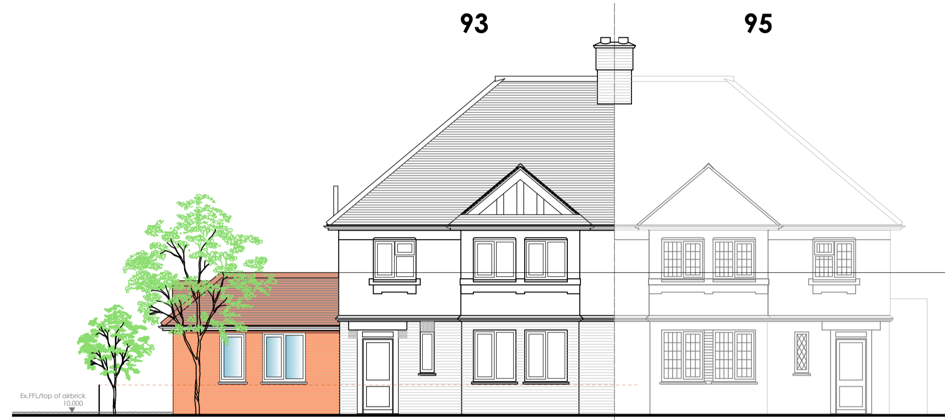
PROPOSED NORTH (FRONT) ELEVATION 1:100