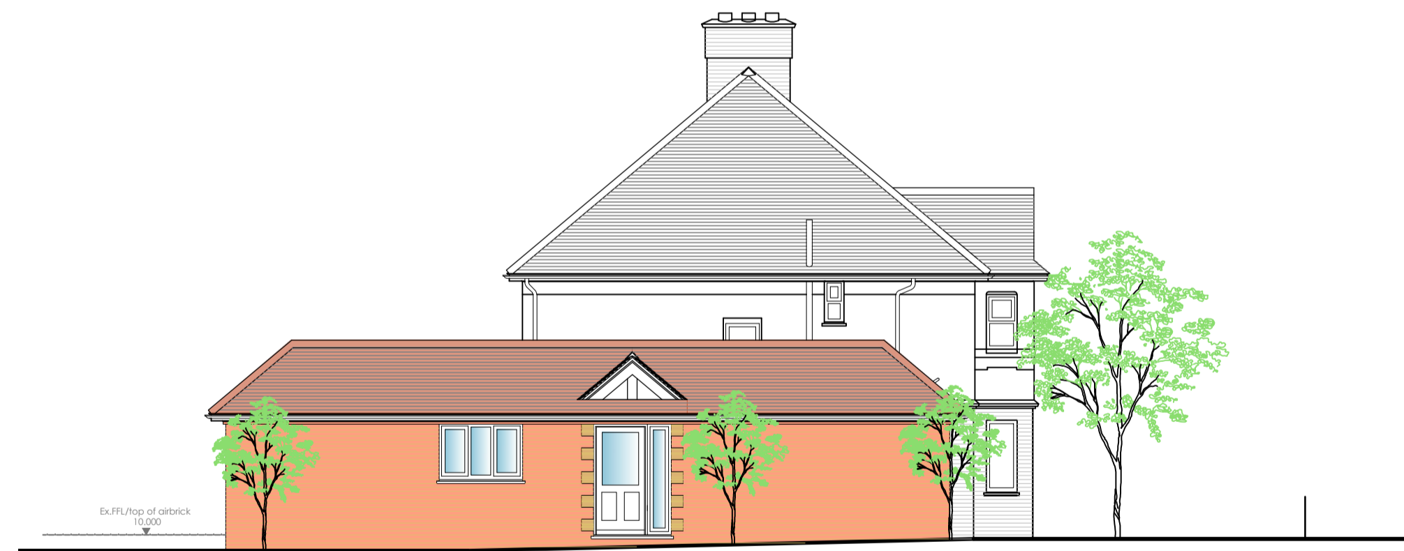
PROPOSED EAST (FLANK) ELEVATION 1:100