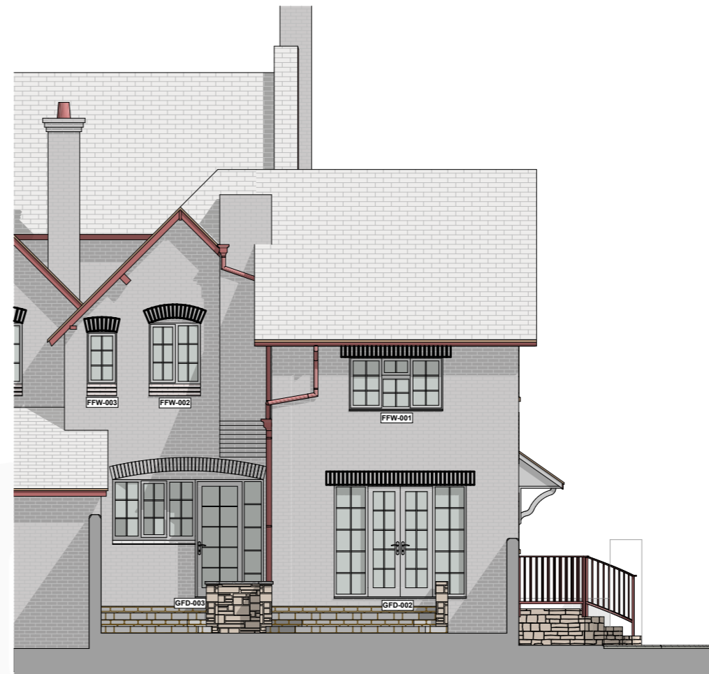
E2 Rear Elevation 1:100