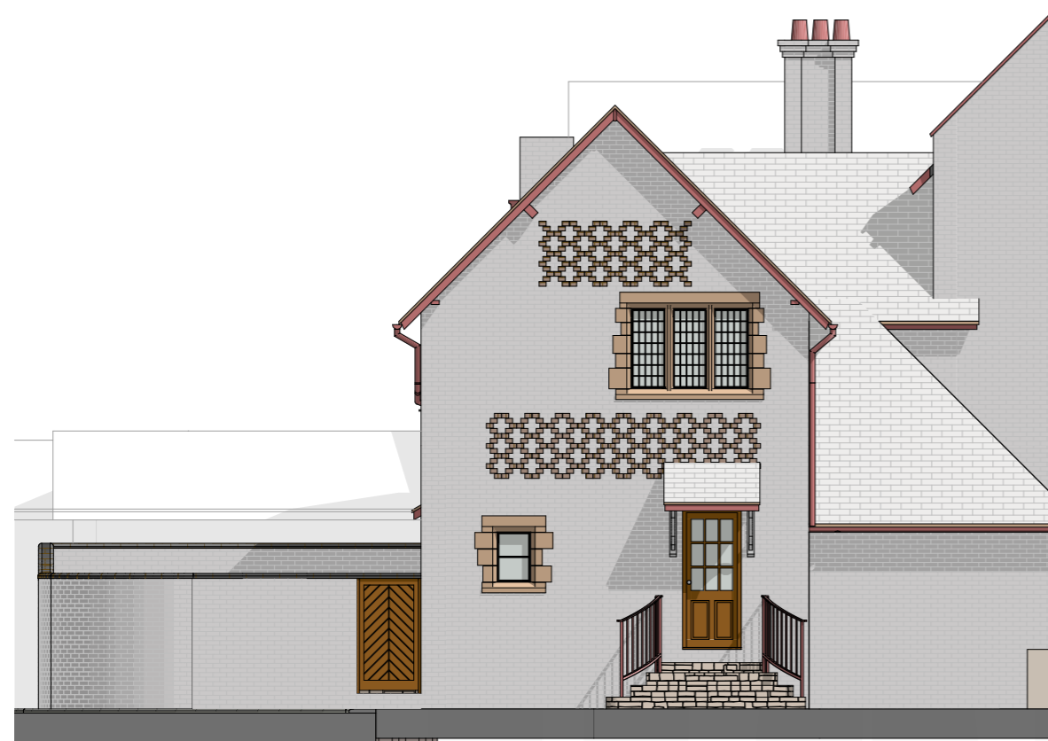
E1 Front Elevation 1:100

Offices: SHREWSBURY, CONWY, CHESTER Tel: 01743 236 400 | Tel: 01244 569 008 Email: HELLO@BASEARCHITECTURE.CO.UK Web: BASEARCHITECTURE.CO.UK