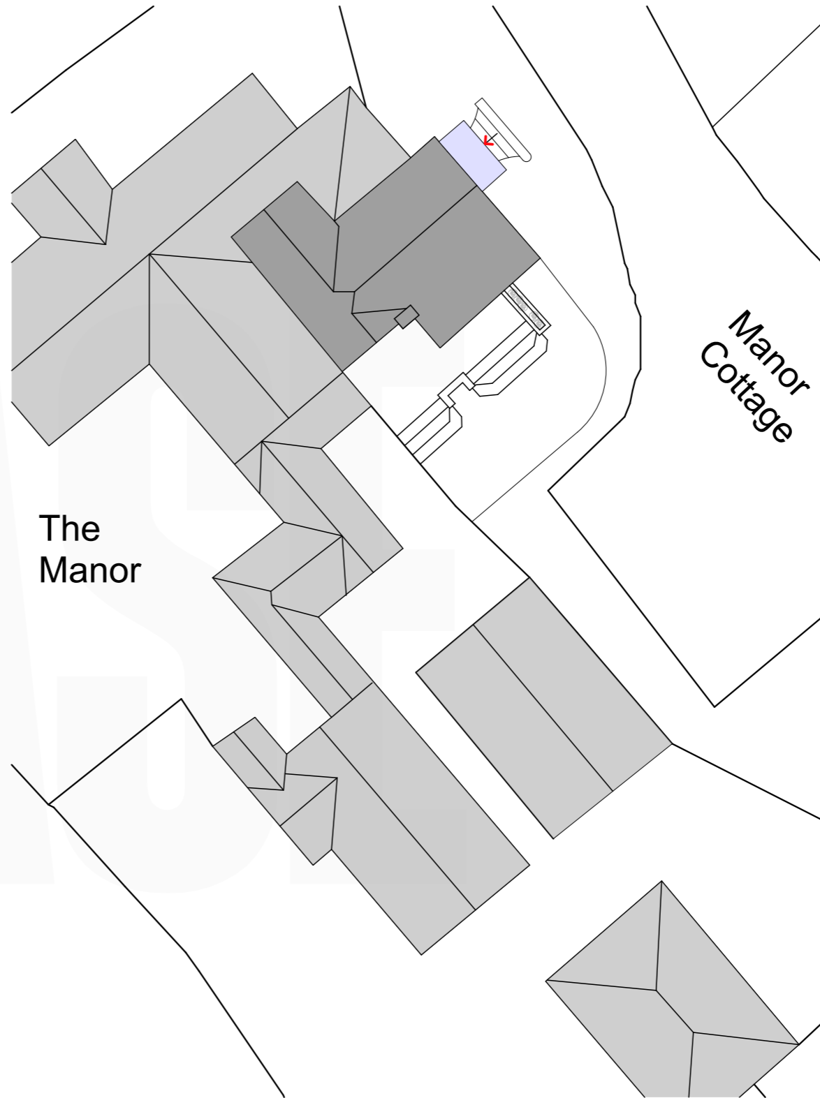
Proposed Block Plan 1:200