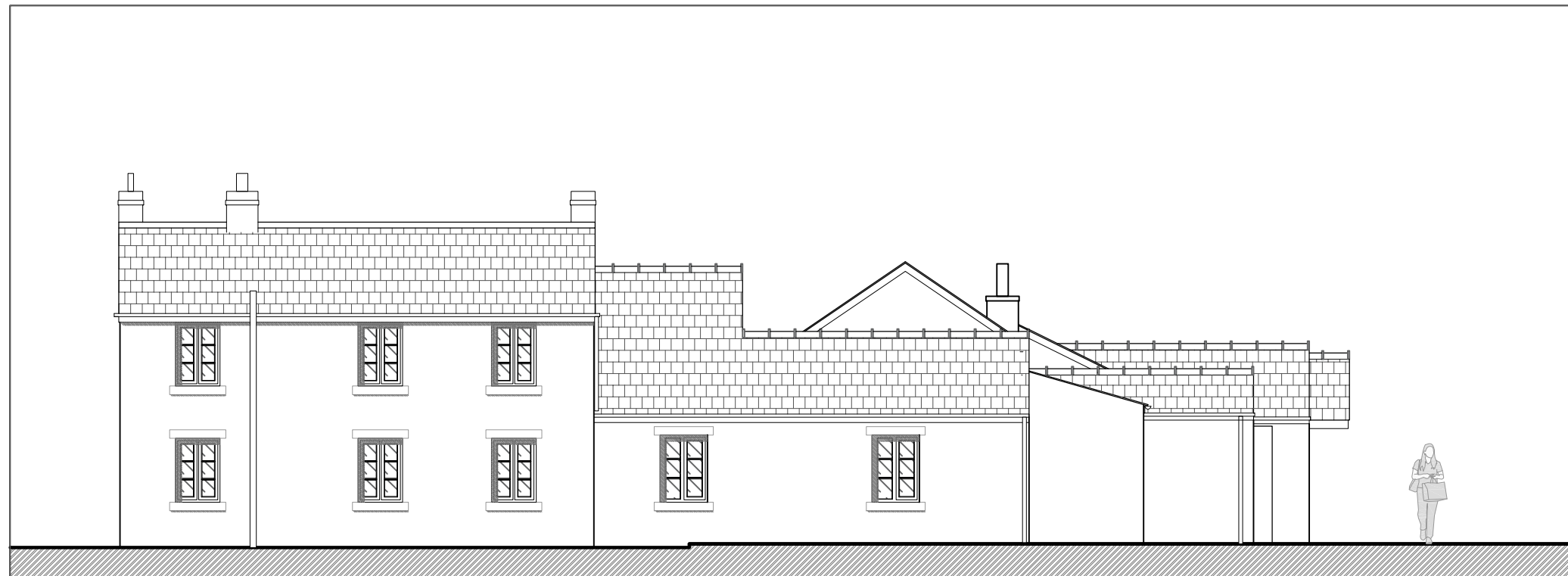
02 - South