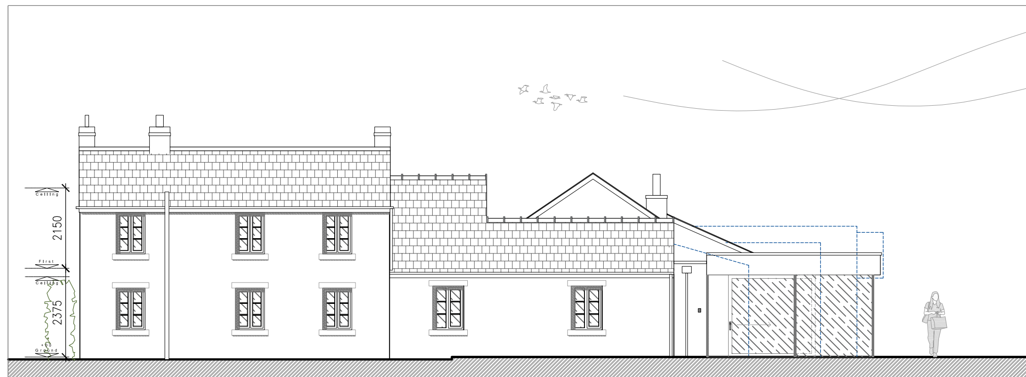
02 - South