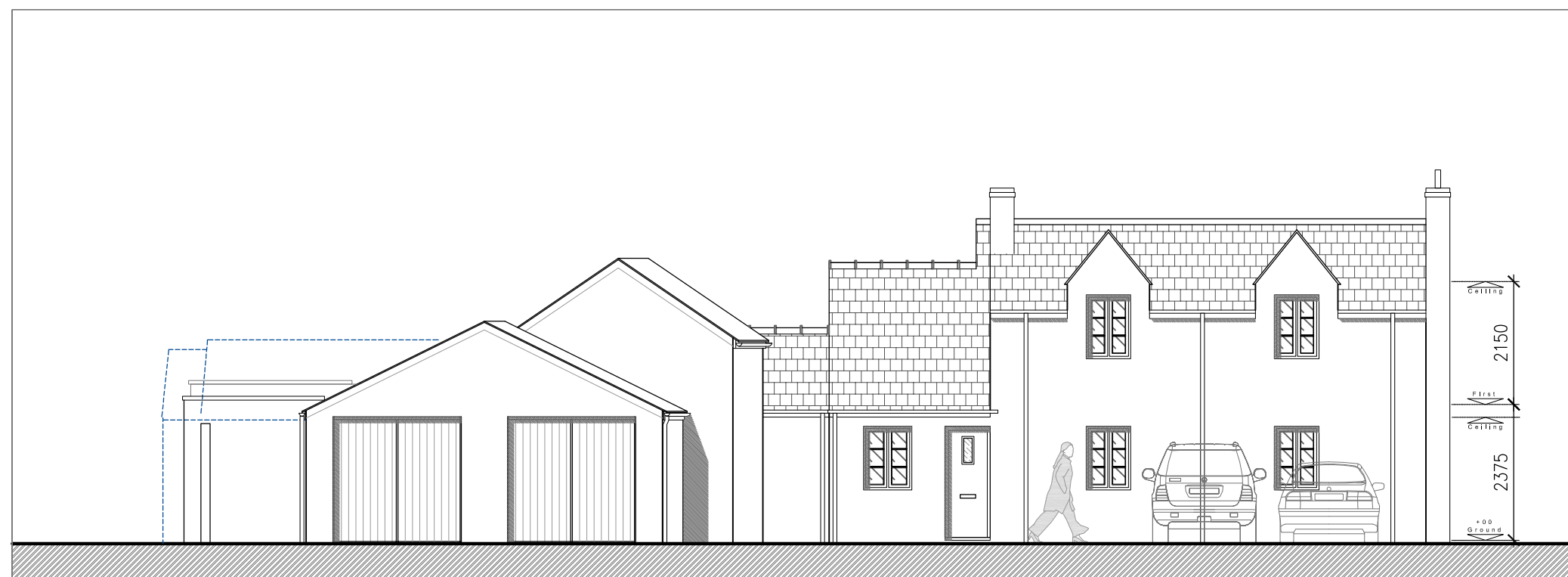
01 - North